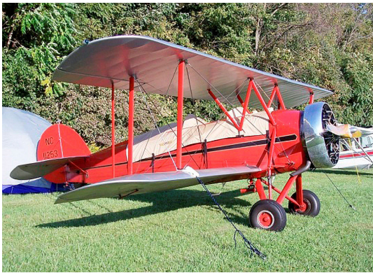
Waco ASO Canopy Cover

the hottest of days. It is water, ice and snow repellent, yet breathable to allow moisture to escape from between the cover and the aircraft surface.