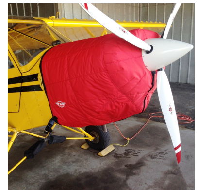
Zlin Savage Insulated Engine Cover