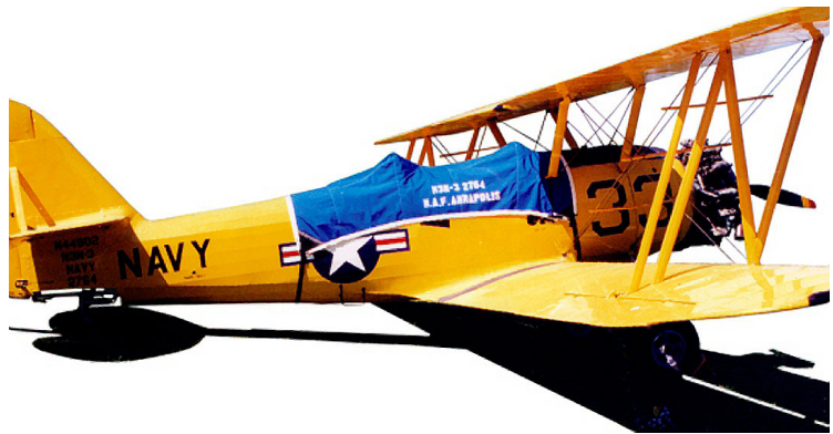
N3N Canopy Cover