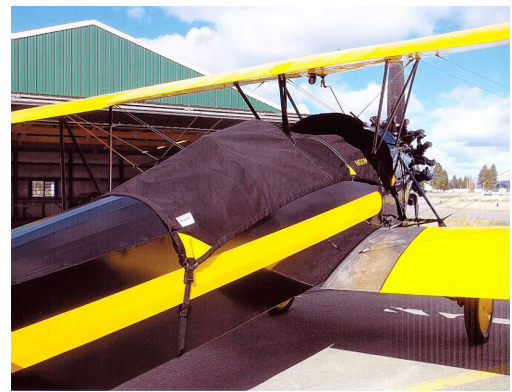
Stearman C3 Canopy Cover