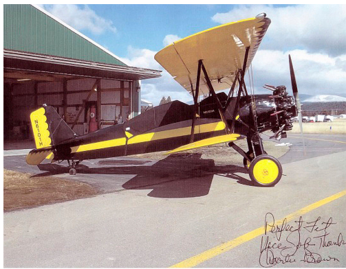
Stearman C3 Canopy Cover