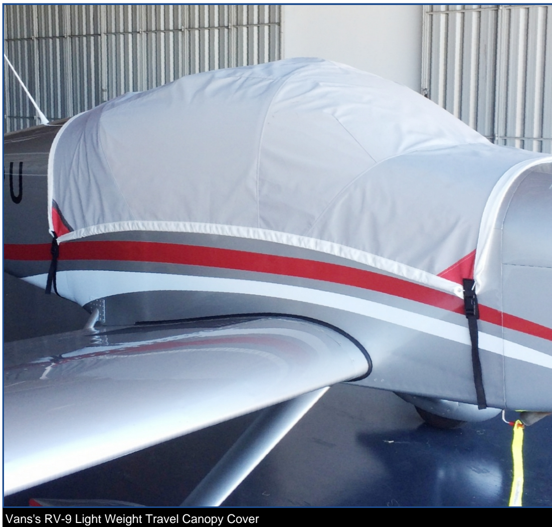
Vans's RV-9 Light Weight Travel Canopy Cover