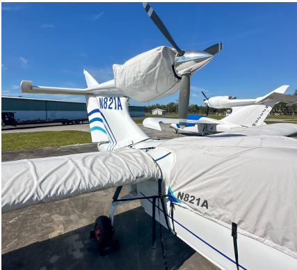
Seawind Seawind 300C & 3000 Amphibian Wing Covers, All Year Use