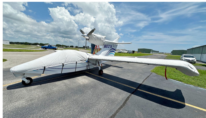
Seawind 3000 Canopy/Nose, Wing & Engine Covers

This cover type is made from Silver Acrylic Sunbrella canvas and is 100% lined with a soft and smooth microfiber. Bruce's Custom Covers developed this material combination especially for aircraft protection. The outer material is medium weight and treated for water resistance, UV resistance and anti-static buildup. The inner lining is a very soft and smooth microfiber to prevent scratching. The material is very reflective, and tests show that the cabin interior temperature can be reduced to near-ambient temperature on the hottest of days. It is water, ice and snow repellent, yet breathable to allow moisture to escape from between the cover and the aircraft surface.