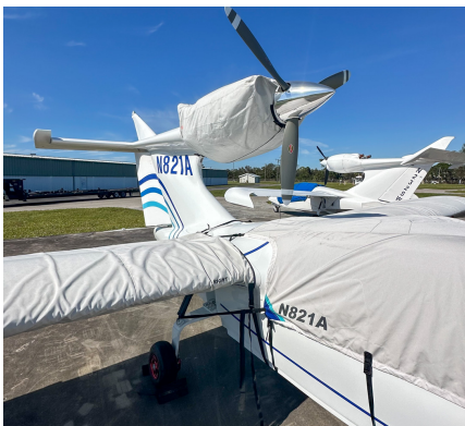
Seawind Seawind 300C & 3000 Amphibian Wing Covers, All Year Use