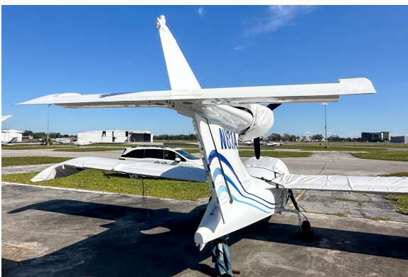
Seawind Seawind 300C & 3000 Amphibian Wing Covers, All Year Use