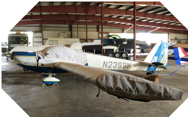
Scheibe Falke SF25 Canopy & Wing Covers