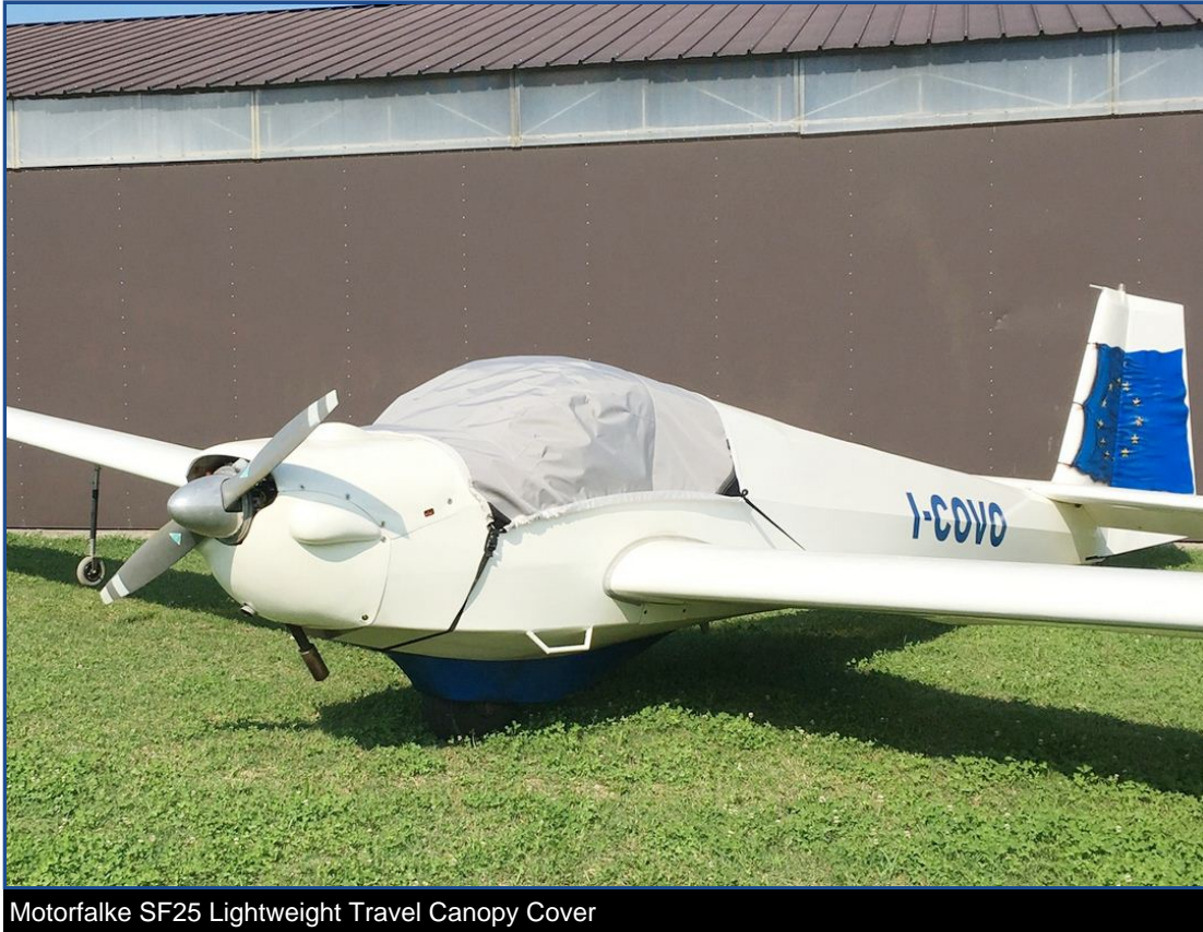
Motorfalke SF25 Lightweight Travel Canopy Cover