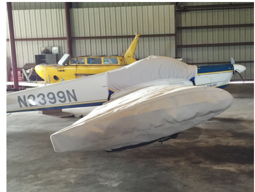
Scheibe Falke SF25 Canopy & Wing Covers