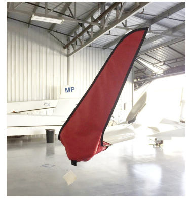
Schleicher ASH Wingtip Pads