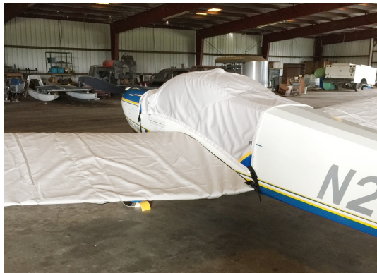
Scheibe Falke SF25 Canopy & Wing Covers