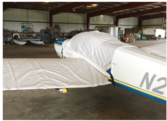
Scheibe Falke SF25 Canopy & Wing Covers