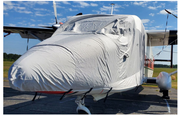
Short Brothers Sherpa, Skyvan, 330 & 360 (C-23) Forward Fuselage/Nose Cover