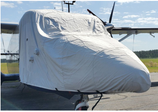
Short Brothers Sherpa, Skyvan, 330 & 360 (C-23) Forward Fuselage/Nose Cover