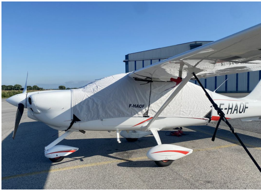
Tecnam P2010 Over-Top Canopy Cover