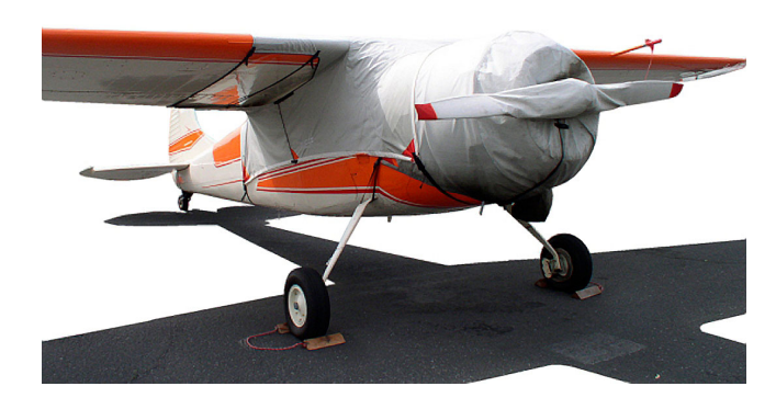
Cessna 195 Over-Top Canopy, Engine & Prop Covers