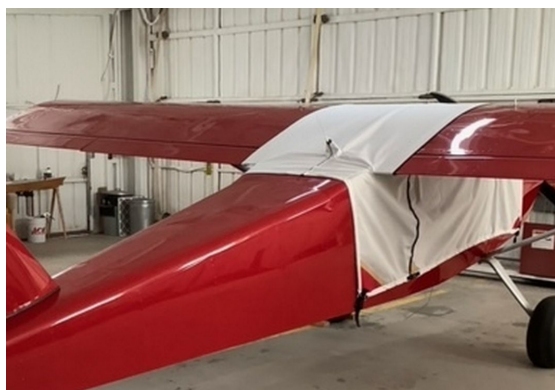
Rans S-21 Over The Top Canopy Cover