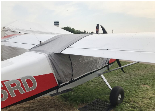
Rans S-21 Travel Canopy Cover