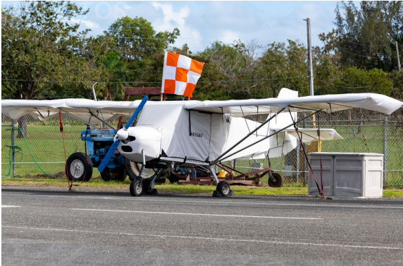
Best Off Skyranger Canopy, Wings & Empennage Covers