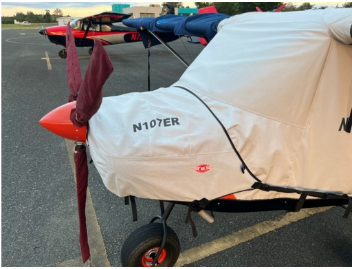
Best Off Skyranger Canopy Cover, Engine Cover