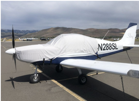
Sling 2 Canopy/Engine Cover