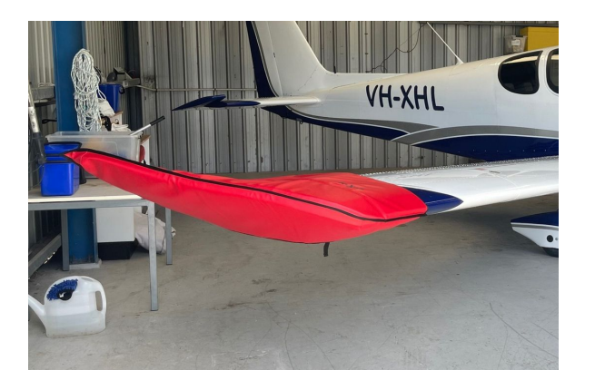
Sling TSI Wingtip Pads