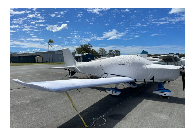
Sling 4 TSi Complete Cover Set

WINTER USE MATERIAL - Made with Solution-Dyed Polyester fabric, this option is intended for seasonal use to aid in deicing, rain mitigation, or for occasional travel. The material is lighter and more compact, but more susceptible to UV damage and may have a shorter useful life if used continuously outside than the all-year use material.