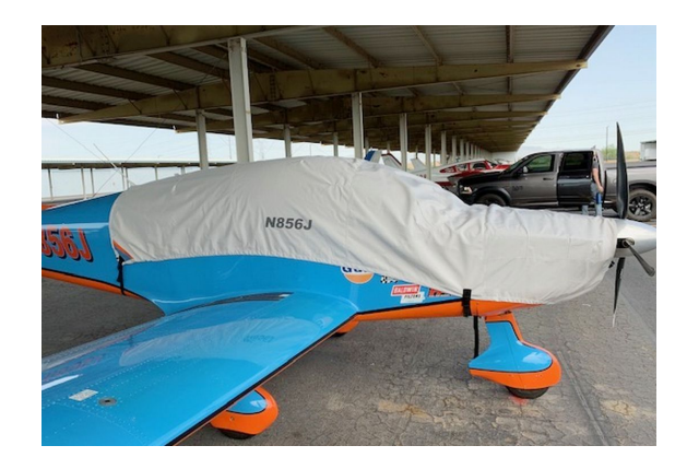
Airplane Factory Sling 4 Canopy/Engine Cover

This cover type is made from Silver Acrylic Sunbrella canvas and is 100% lined with a soft and smooth microfiber. Bruce's Custom Covers developed this material combination especially for aircraft protection. The outer material is medium weight and treated for water resistance, UV resistance and anti-static buildup. The inner lining is a very soft and smooth microfiber to prevent scratching. The material is very reflective, and tests show that the cabin interior temperature can be reduced to near-ambient temperature on the hottest of days. It is water, ice and snow repellent, yet breathable to allow moisture to escape from between the cover and the aircraft surface.