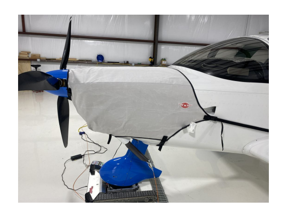
Sling TSI Engine Cover