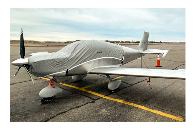
Sling TSi Travel Weight Canopy/Engine Cover