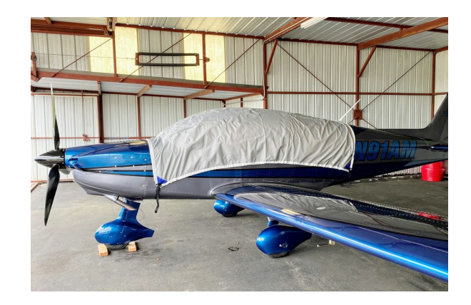
Sling 4 TSI Light Weight Travel Cover

Travel Covers are made with Silver Solution-Dyed Polyester fabric and only lined over the windshield to save weight. The material is lightweight and more compact for easy stowage in the aircraft. The polyester material is water resistant, but only intended for occasional use outside. We also have an ultra lightweight material available for fitted hangar dust covers. For daily outdoor use, the non-travel Sunbrella Cover is the best choice.