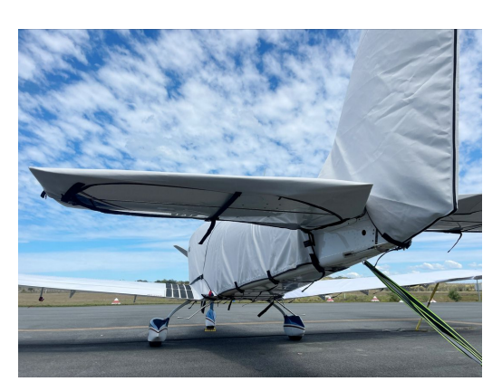
Sling 4 TSi Empennage Cover