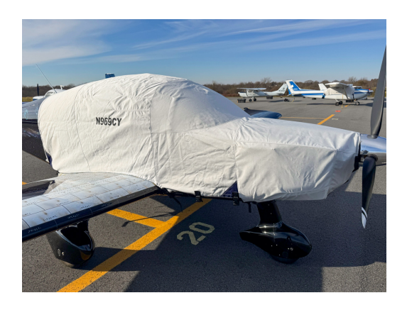
Sling TSi Extended Canopy/Engine Cover