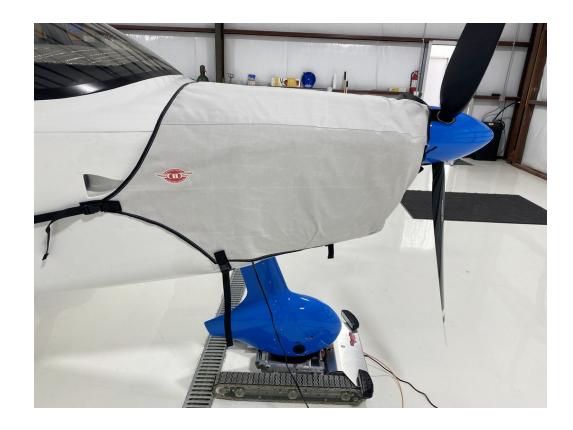
Sling TSI Engine Cover

This cover type is made from Silver Acrylic Sunbrella canvas and is 100% lined with a soft and smooth microfiber. Bruce's Custom Covers developed this material combination especially for aircraft protection. The outer material is medium weight and treated for water resistance, UV resistance and anti-static buildup. The inner lining is a very soft and smooth microfiber to prevent scratching. The material is very reflective, and tests show that the cabin interior temperature can be reduced to near-ambient temperature on the hottest of days. It is water, ice and snow repellent, yet breathable to allow moisture to escape from between the cover and the aircraft surface.