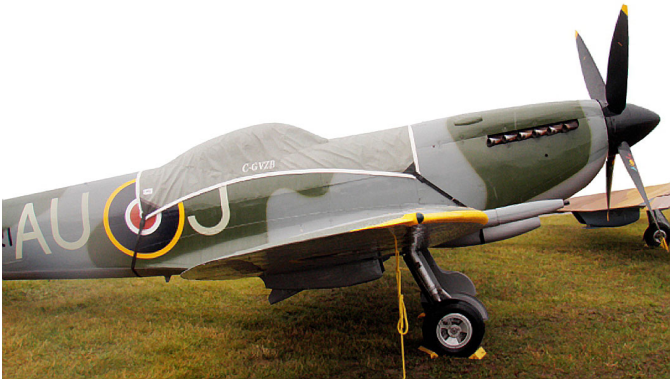
Supermarine Spitfire Mark 16 Canopy Cover