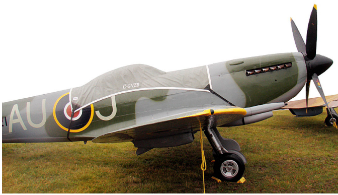
Supermarine Spitfire Mark 16 Canopy Cover