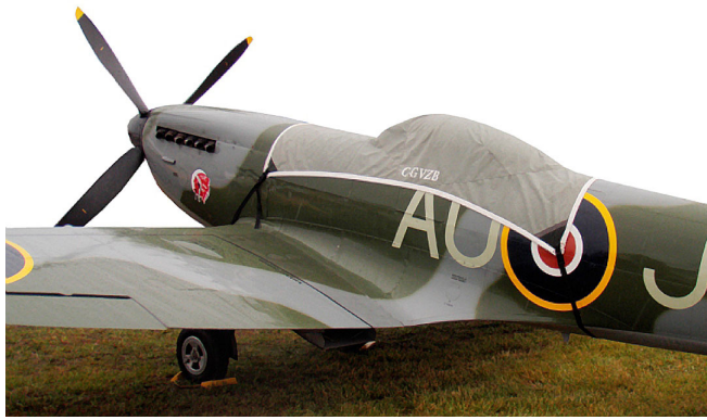
Supermarine Spitfire Mark 16 Canopy Cover