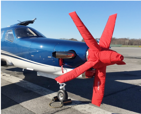
Socata TBM Insulated 5-Blade Prop/Spinner Cover

This cover type is made from Silver Acrylic Sunbrella canvas and is 100% lined with a soft and smooth microfiber. Bruce's Custom Covers developed this material combination especially for aircraft protection. The outer material is medium weight and treated for water resistance, UV resistance and anti-static buildup. The inner lining is a very soft and smooth microfiber to prevent scratching. The material is very reflective, and tests show that the cabin interior temperature can be reduced to near-ambient temperature on the hottest of days. It is water, ice and snow repellent, yet breathable to allow moisture to escape from between the cover and the aircraft surface.