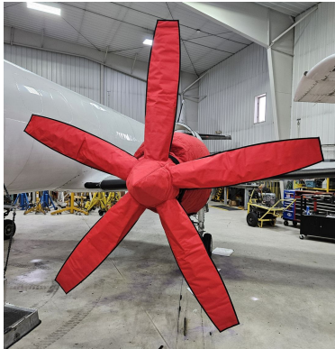
Fairchild Metro 5 Blade Insulated Insulated Prop Covers