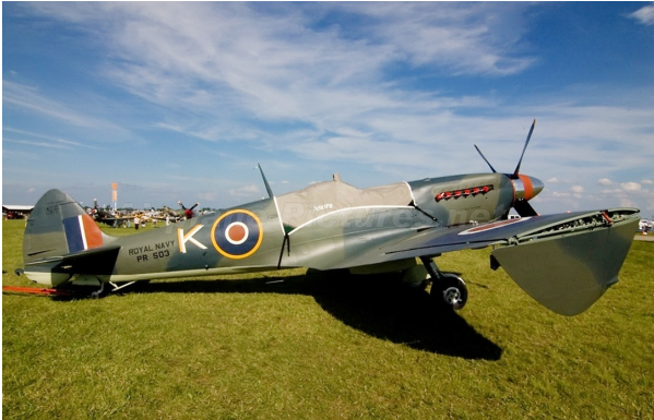
Supermarine Spitfire Mk IX Canopy Cover

Travel Covers are made with Silver Solution-Dyed Polyester fabric and only lined over the windshield to save weight. The material is lightweight and more compact for easy stowage in the aircraft. The polyester material is water resistant, but only intended for occasional use outside. We also have an ultra lightweight material available for fitted hangar dust covers. For daily outdoor use, the non-travel Sunbrella Cover is the best choice.