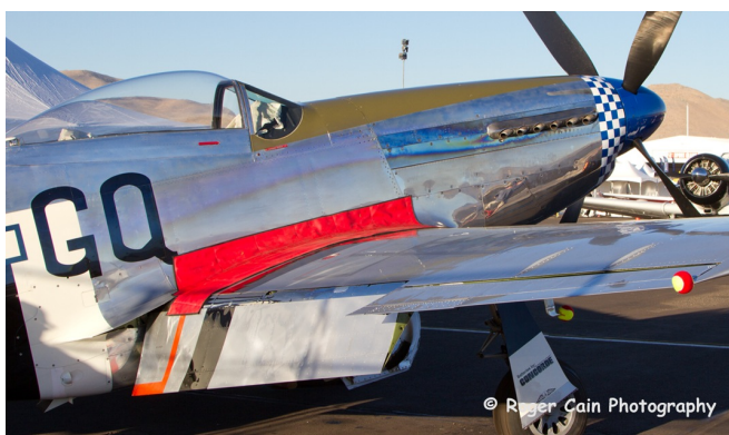
North American P-51 Wing Walk Pad