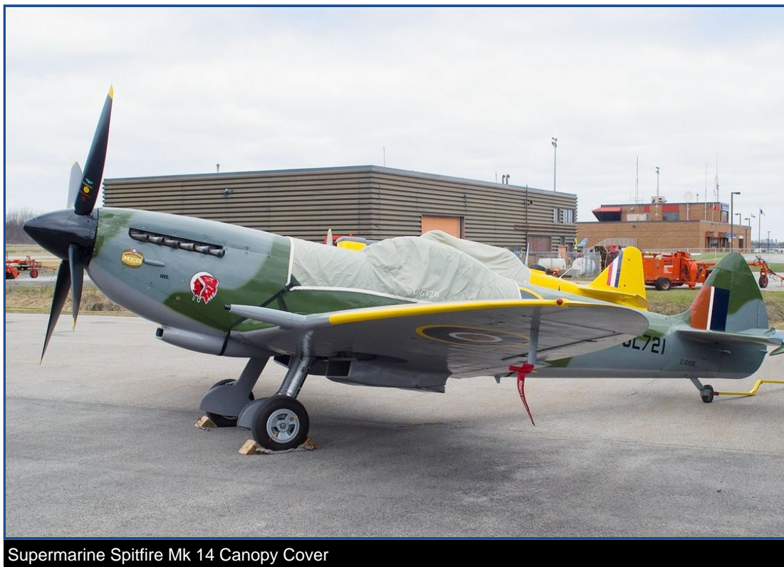
Supermarine Spitfire Mk 14 Canopy Cover