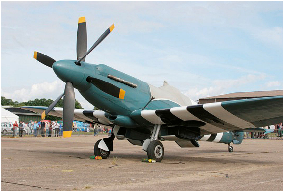
Supermarine Spitfire XIX Canopy Cover