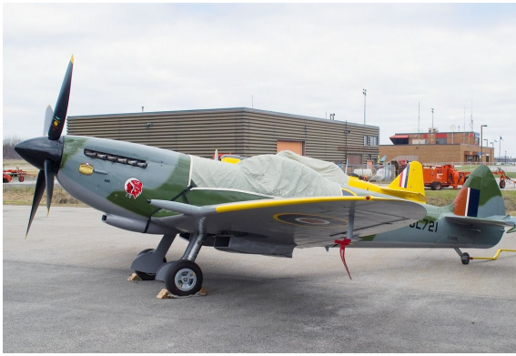
Supermarine Spitfire Mk 14 Canopy Cover