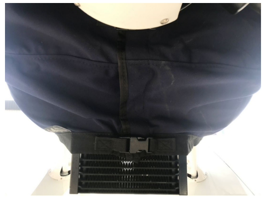
Seamax M22 Engine Cover