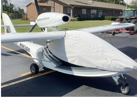
Seamax Canopy/Nose Cover

The material is very reflective, and tests show that the cabin interior temperature can be reduced to near-ambient temperature on the hottest of days. It is water, ice and snow repellent, yet breathable to allow moisture to escape from between the cover and the aircraft surface.