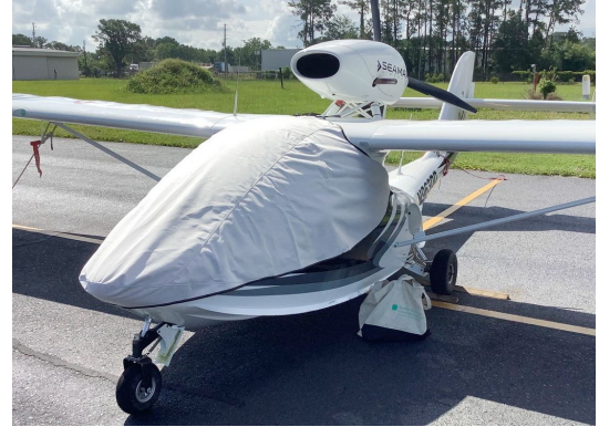
Seamax Canopy/Nose Cover