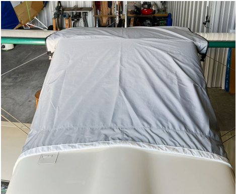
Sorrell SNS-7 Hiperbipe Over The Top Travel Canopy Cover