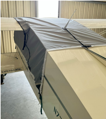
Sorrell SNS-7 Hiperbipe Over The Top Travel Canopy Cover

Travel Covers are made with Silver Solution-Dyed Polyester fabric and only lined over the windshield to save weight. The material is lightweight and more compact for easy stowage in the aircraft. The polyester material is water resistant, but only intended for occasional use outside. We also have an ultra lightweight material available for fitted hangar dust covers. For daily outdoor use, the non-travel Sunbrella Cover is the best choice.