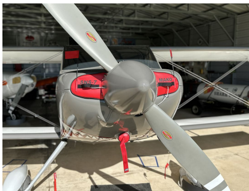
SNS-7 HiperBipe Engine Inlet Plugs

Engine Inlet Plugs are custom fit for your Sorrell Hiperbipe SNS-7 intakes, made with heavy-duty vinyl material, and stuffed with a single block of sculpted urethane foam. Each plug has a zipper that allows the foam to be removed and dried if necessary. Engine plugs have warning flags that are visible from the cockpit or 'remove before flight' streamers sewn onto the face of the plugs. Most plugs are imprinted with the aircraft registration number in black for an extra charge. Storage bag NOT included. Engine plugs may be inserted after flight when the engine is still warm. Engine Inlet Plugs are commonly referred to as Cowl Plugs, Intake Plugs, Cowl Blocks, Engine Blocks, and Engine Bungs.