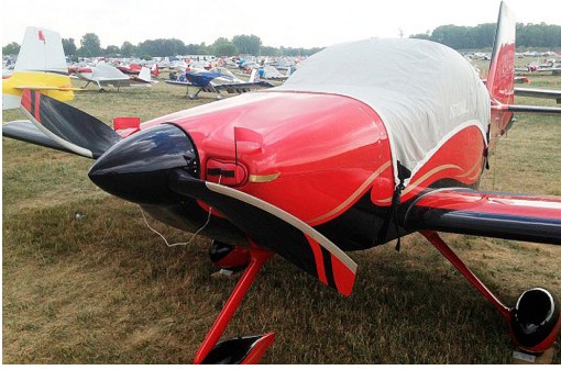
Van's RV-7 Canopy Cover & Engine Inlet Plugs

Engine Inlet Plugs are custom fit for your Sorrell Hiperbipe SNS-7 intakes, made with heavy-duty vinyl material, and stuffed with a single block of sculpted urethane foam. Each plug has a zipper that allows the foam to be removed and dried if necessary. Engine plugs have warning flags that are visible from the cockpit or 'remove before flight' streamers sewn onto the face of the plugs. Most plugs are imprinted with the aircraft registration number in black for an extra charge. Storage bag NOT included. Engine plugs may be inserted after flight when the engine is still warm. Engine Inlet Plugs are commonly referred to as Cowl Plugs, Intake Plugs, Cowl Blocks, Engine Blocks, and Engine Bungs.