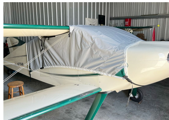
Sorrell SNS-7 Hiperbipe Over The Top Travel Canopy Cover