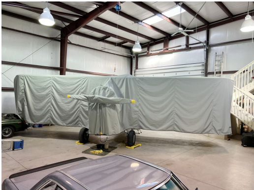
Stearman PT-13 Full Body Dust Cover