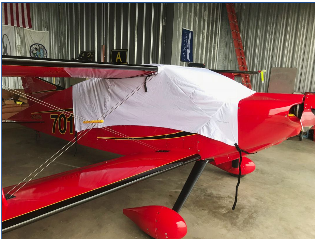
Sorrell Hiperbiplane Canopy Cover (test fit cover)