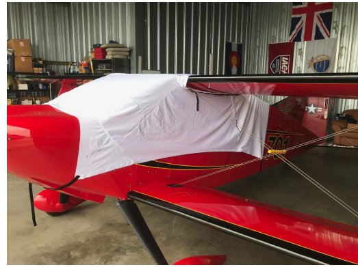
Sorrell Hiperbipe Canopy Cover (test fit cover)