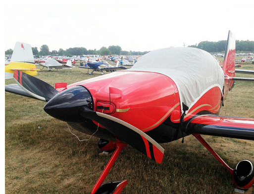
Van's RV-7 Canopy Cover & Engine Inlet Plugs