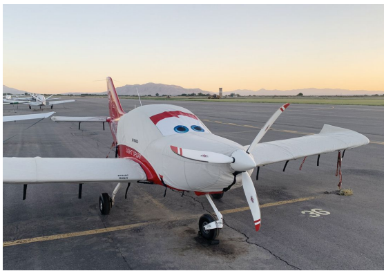
SportCruiser Canopy/Engine & Wing Covers