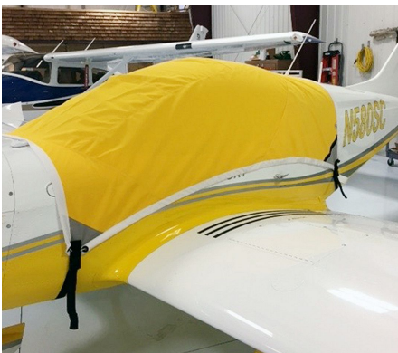
Custom Yellow Canopy Cover

This cover type is made from Silver Acrylic Sunbrella canvas and is 100% lined with a soft and smooth microfiber. Bruce's Custom Covers developed this material combination especially for aircraft protection. The outer material is medium weight and treated for water resistance, UV resistance and anti-static buildup. The inner lining is a very soft and smooth microfiber to prevent scratching. The material is very reflective, and tests show that the cabin interior temperature can be reduced to near-ambient temperature on the hottest of days. It is water, ice and snow repellent, yet breathable to allow moisture to escape from between the cover and the aircraft surface.