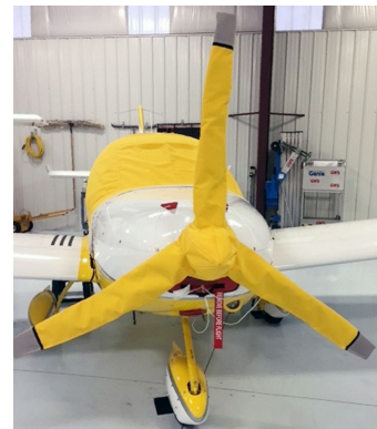
Custom Yellow Canopy Cover, Prop/Spinner, and Inlet Plugs