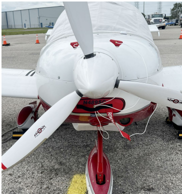
SportCruiser Engine Inlet Plugs

Engine Inlet Plugs are custom fit for your Czech Aircraft Works SportCruiser intakes, made with heavy-duty vinyl material, and stuffed with a single block of sculpted urethane foam. Each plug has a zipper that allows the foam to be removed and dried if necessary. Engine plugs have warning flags that are visible from the cockpit or 'remove before flight' streamers sewn onto the face of the plugs. Most plugs are imprinted with the aircraft registration number in black for an extra charge. Storage bag NOT included. Engine plugs may be inserted after flight when the engine is still warm. Engine Inlet Plugs are commonly referred to as Cowl Plugs, Intake Plugs, Cowl Blocks, Engine Blocks, and Engine Bungs.