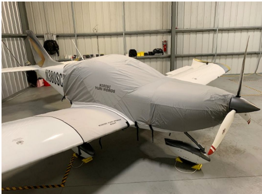
Czech Sport Travel Light Weight Canopy/Engine Cover, Wing Locker Covers

Travel Covers are made with Silver Solution-Dyed Polyester fabric and only lined over the windshield to save weight. The material is lightweight and more compact for easy stowage in the aircraft. The polyester material is water resistant, but only intended for occasional use outside. We also have an ultra lightweight material available for fitted hangar dust covers. For daily outdoor use, the non-travel Sunbrella Cover is the best choice.