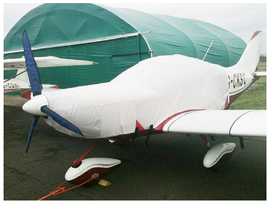
PiperSport Canopy/Engine Cover, Wing Locker Covers