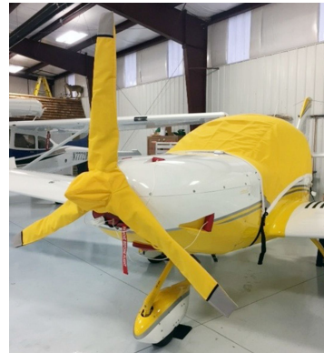
Custom Yellow Canopy Cover, Prop/Spinner, and Inlet Plugs