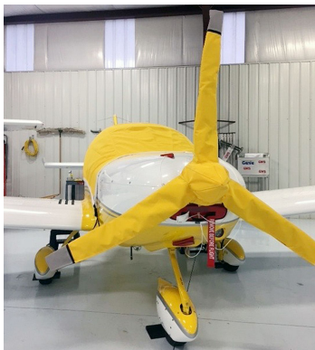
Custom Yellow Canopy Cover, Prop/Spinner, and Inlet Plugs

This cover type is made from Silver Acrylic Sunbrella canvas and is 100% lined with a soft and smooth microfiber. Bruce's Custom Covers developed this material combination especially for aircraft protection. The outer material is medium weight and treated for water resistance, UV resistance and anti-static buildup. The inner lining is a very soft and smooth microfiber to prevent scratching. The material is very reflective, and tests show that the cabin interior temperature can be reduced to near-ambient temperature on the hottest of days. It is water, ice and snow repellent, yet breathable to allow moisture to escape from between the cover and the aircraft surface.