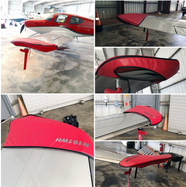
Cirrus SR22 Wingtip Pads, G5 Models

Designed to prevent damage to the aircraft extremities in crowded hangars, these products are made of bright red Naugahyde and thickly padded with a sandwich of closed cell foam.