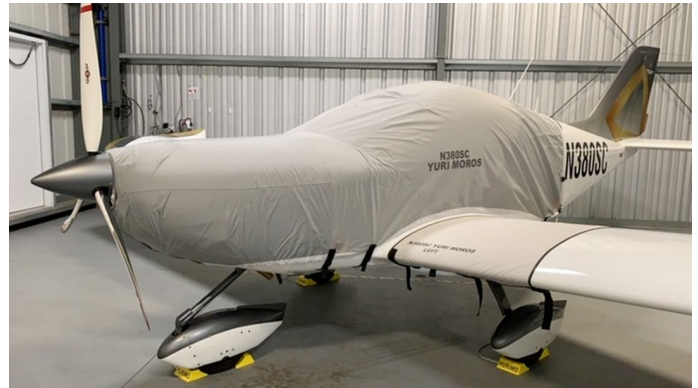
Czech Sport Travel Light Weight Canopy/Engine Cover, Wing Locker Covers