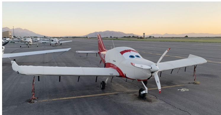
SportCruiser Canopy/Engine & Wing Covers