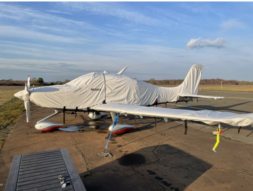
Cirrus SR-22 Complete Cover Set