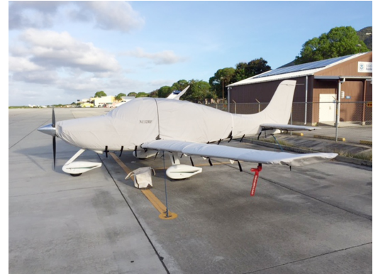
Cirrus SR-22 Full Cover Set