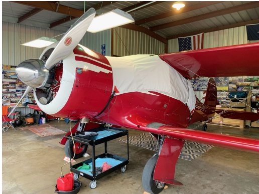
Beech Staggerwing D17S Canopy Cover

This cover type is made from Silver Acrylic Sunbrella canvas and is 100% lined with a soft and smooth microfiber. Bruce's Custom Covers developed this material combination especially for aircraft protection. The outer material is medium weight and treated for water resistance, UV resistance and anti-static buildup. The inner lining is a very soft and smooth microfiber to prevent scratching. The material is very reflective, and tests show that the cabin interior temperature can be reduced to near-ambient temperature on the hottest of days. It is water, ice and snow repellent, yet breathable to allow moisture to escape from between the cover and the aircraft surface.