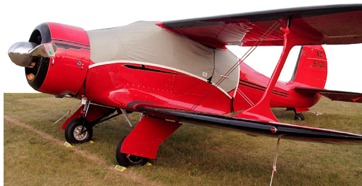
Beech Staggerwing Canopy Cover

Travel Covers are made with Silver Solution-Dyed Polyester fabric and only lined over the windshield to save weight. The material is lightweight and more compact for easy stowage in the aircraft. The polyester material is water resistant, but only intended for occasional use outside. We also have an ultra lightweight material available for fitted hangar dust covers. For daily outdoor use, the non-travel Sunbrella Cover is the best choice.