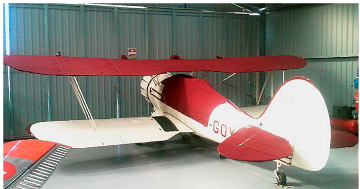
Beech Staggerwing Complete Cover Set, Tail Detail Waco UPF-7 Upper Wing Cover, Horizontal Stabilizer Cover & Canopy Cover