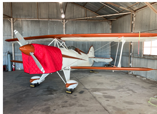
SKYBOLT, Insulated Hangar Blanket, Custom Fit Interior Use)