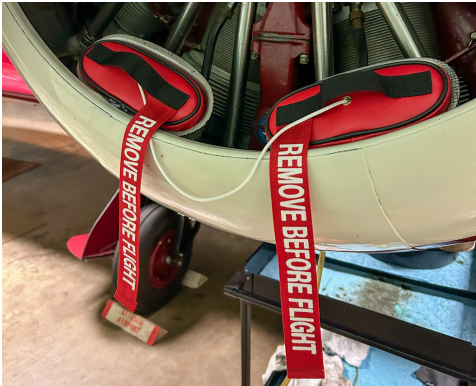
Beech Staggerwing Carb Inlet Plugs, Located Inside Engine

Engine Inlet Plugs are custom fit for your Beech Staggerwing intakes, made with heavy-duty vinyl material, and stuffed with a single block of sculpted urethane foam. Each plug has a zipper that allows the foam to be removed and dried if necessary. Engine plugs have warning flags that are visible from the cockpit or 'remove before flight' streamers sewn onto the face of the plugs. Most plugs are imprinted with the aircraft registration number in black for an extra charge. Storage bag NOT included. Engine plugs may be inserted after flight when the engine is still warm. Engine Inlet Plugs are commonly referred to as Cowl Plugs, Intake Plugs, Cowl Blocks, Engine Blocks, and Engine Bungs.