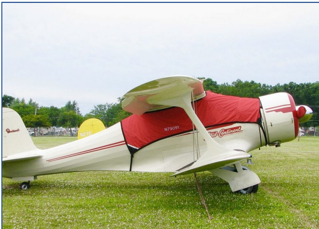
Beech Staggerwing Canopy Cover