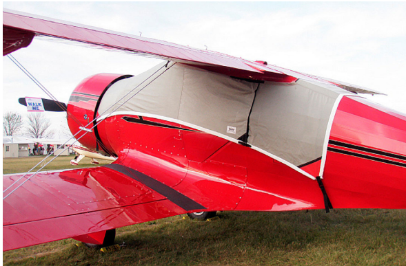
Beech Staggerwing Canopy Cover