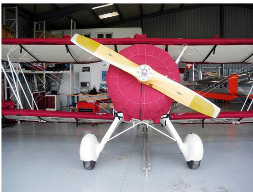
Waco UPF-7 Engine Cover

This cover type is made from Silver Acrylic Sunbrella canvas and is 100% lined with a soft and smooth microfiber. Bruce's Custom Covers developed this material combination especially for aircraft protection. The outer material is medium weight and treated for water resistance, UV resistance and anti-static buildup. The inner lining is a very soft and smooth microfiber to prevent scratching. The material is very reflective, and tests show that the cabin interior temperature can be reduced to near-ambient temperature on the hottest of days. It is water, ice and snow repellent, yet breathable to allow moisture to escape from between the cover and the aircraft surface.