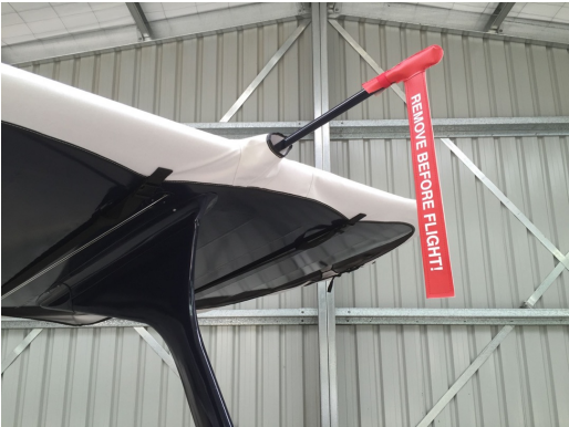
Beech Staggerwing Complete Cover Set, Upper Wing Detail