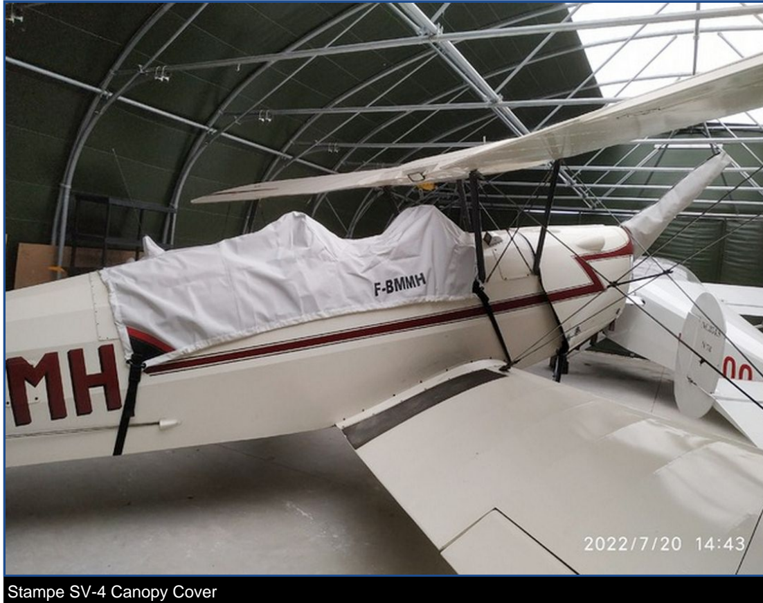
Stampe SV-4 Canopy Cover