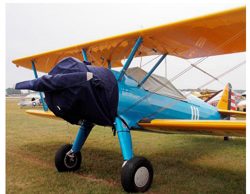
Stearman PT-13 Engine Cover