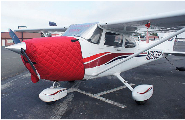
Cessna 172 Insulated Engine Cover, fully enclosed

Windshield Heatshields are interior sunshades for an aircraft's front windshield. The product is a unique composite of closed-cell foam with a silver mylar finish. The semi-rigid design is stiff enough to stand along the inside of the windshield using sun visors or window framing. It folds up flat and easily stores in the included storage sleeve. Some designs may require velcro and suction cups or split right and left sides. A Heatshield is an excellent short-term remedy for cockpit overheating. An external fabric cover is far more effective and practical for long-term protection.