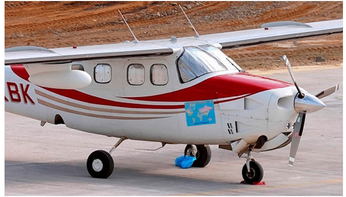
Cessna P210 HeatShield Set