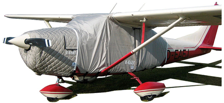
Cessna 182 Insulated Engine Cover ext. to l.e of nose gear, Extended Canopy Cover