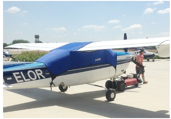
Cessna 210 Over-Top Canopy Cover