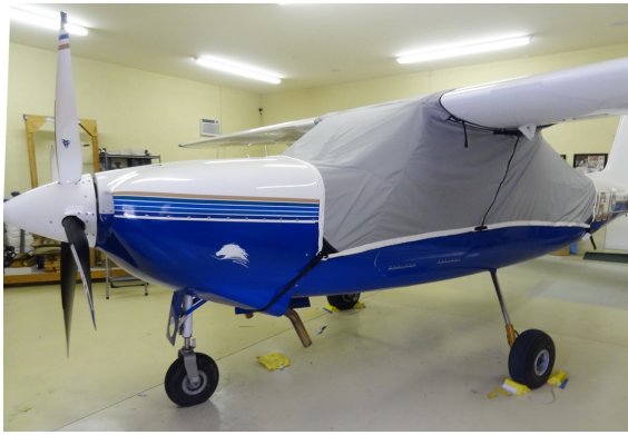
Stallion Canopy Cover, Light Weight Travel Type