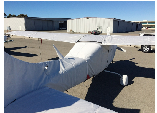
Cessna 210 Full Cover Set