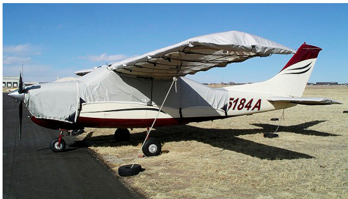
Cessna 210 Engine, Canopy Cover w/ Baggage Door ext. & Wing Covers

This cover type is made from Silver Acrylic Sunbrella canvas and is 100% lined with a soft and smooth microfiber. Bruce's Custom Covers developed this material combination especially for aircraft protection. The outer material is medium weight and treated for water resistance, UV resistance and anti-static buildup. The inner lining is a very soft and smooth microfiber to prevent scratching. The material is very reflective, and tests show that the cabin interior temperature can be reduced to near-ambient temperature on the hottest of days. It is water, ice and snow repellent, yet breathable to allow moisture to escape from between the cover and the aircraft surface.