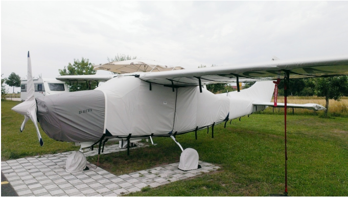
Cessna 210 Complete Cover Set

This cover type is made from Silver Acrylic Sunbrella canvas and is 100% lined with a soft and smooth microfiber. Bruce's Custom Covers developed this material combination especially for aircraft protection. The outer material is medium weight and treated for water resistance, UV resistance and anti-static buildup. The inner lining is a very soft and smooth microfiber to prevent scratching. The material is very reflective, and tests show that the cabin interior temperature can be reduced to near-ambient temperature on the hottest of days. It is water, ice and snow repellent, yet breathable to allow moisture to escape from between the cover and the aircraft surface.