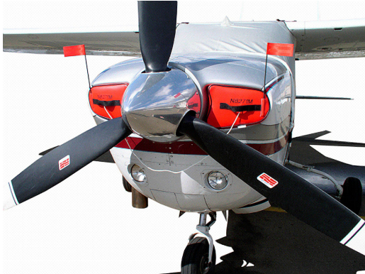
Cessna 210 Engine Plugs

Engine Inlet Plugs are custom fit for your Stallion Super Stallion intakes, made with heavy-duty vinyl material, and stuffed with a single block of sculpted urethane foam. Each plug has a zipper that allows the foam to be removed and dried if necessary. Engine plugs have warning flags that are visible from the cockpit or 'remove before flight' streamers sewn onto the face of the plugs. Most plugs are imprinted with the aircraft registration number in black for an extra charge. Storage bag NOT included. Engine plugs may be inserted after flight when the engine is still warm. Engine Inlet Plugs are commonly referred to as Cowl Plugs, Intake Plugs, Cowl Blocks, Engine Blocks, and Engine Bungs.