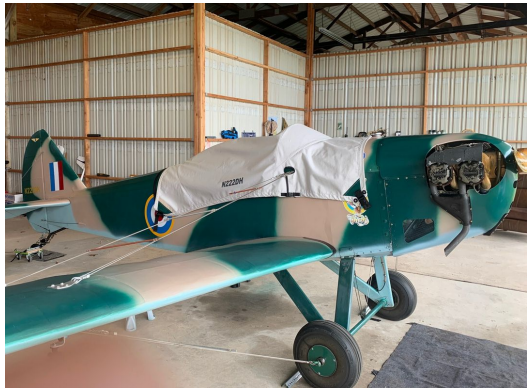
Bowers Fly Baby Canopy Cover