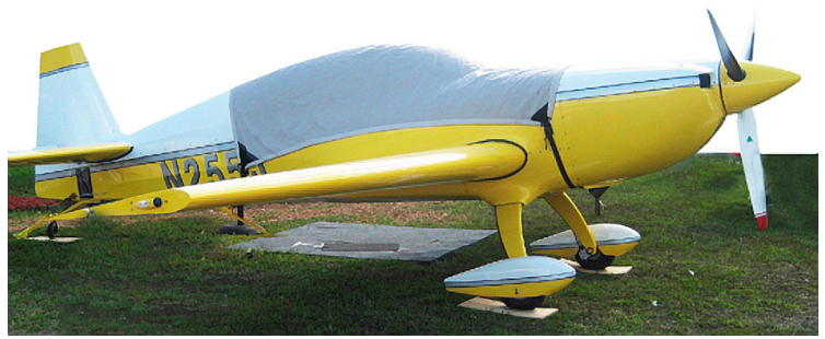
Xtremeair Canopy Cover