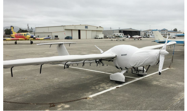
Distar Sundancer LSA Extended Canopy/Engine, Prop, Wheelpant, Wings & Empennage Covers