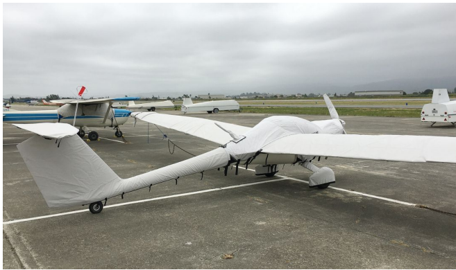
Distar Sundancer LSA Extended Canopy/Engine, Prop, Wheelpants, Wings & Empennage Covers