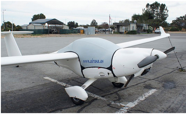
Lambda Travel Canopy Cover