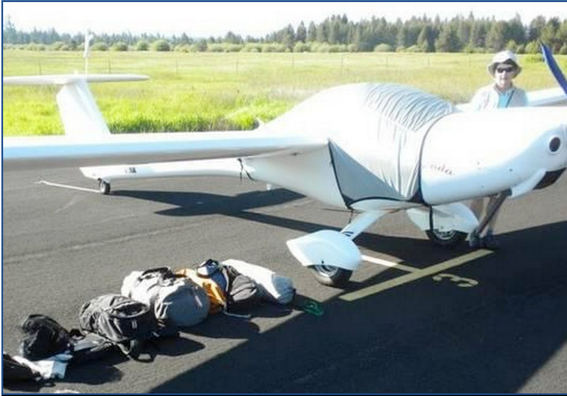
Distar Sundancer Travel Weight Canopy Cover