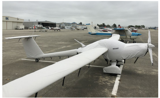
Distar Sundancer LSA Extended Canopy/Engine, Prop, Wheelpants, Wings & Empennage Covers