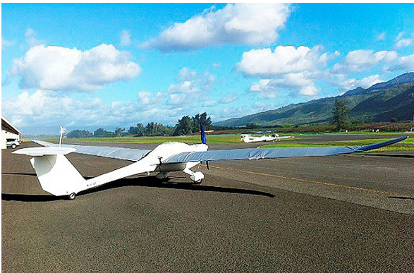
Lambda Canopy/Engine Cover and Wing Covers