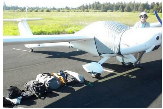
Distar Sundancer Travel Weight Canopy Cover