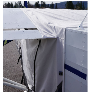
Savannah VG Canopy Cover