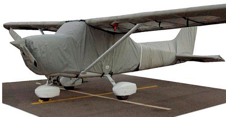
Cessna 172 Propellor Cover, 2 Blade