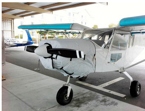
Zenith 801 Insulated Engine Cover