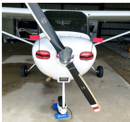
Cessna Skycatcher 162 Engine Inlet Plugs

Engine Inlet Plugs are custom fit for your Savannah VG & S Models intakes, made with heavy-duty vinyl material, and stuffed with a single block of sculpted urethane foam. Each plug has a zipper that allows the foam to be removed and dried if necessary. Engine plugs have warning flags that are visible from the cockpit or 'remove before flight' streamers sewn onto the face of the plugs. Most plugs are imprinted with the aircraft registration number in black for an extra charge. Storage bag NOT included. Engine plugs may be inserted after flight when the engine is still warm. Engine Inlet Plugs are commonly referred to as Cowl Plugs, Intake Plugs, Cowl Blocks, Engine Blocks, and Engine Bungs.