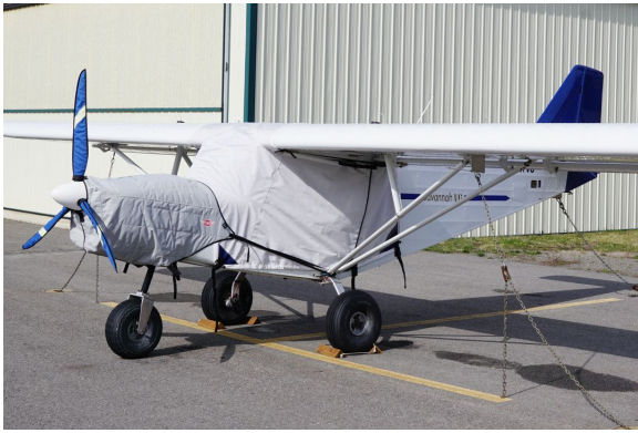
Savannah VG Canopy Cover, Insulated Engine Cover