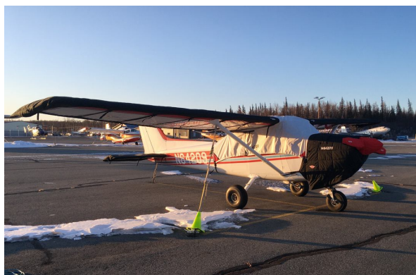
Cessna 172M Canopy, Wings, Horiz. Stab., Insulated Engine & Prop Covers

WINTER USE MATERIAL - Made with Solution-Dyed Polyester fabric, this option is intended for seasonal use to aid in deicing, rain mitigation, or for occasional travel. The material is lighter and more compact, but more susceptible to UV damage and may have a shorter useful life if used continuously outside than the all-year use material.