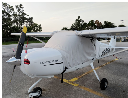
Cessna Skycatcher 162 Canopy Cover and Engine Inlet Plugs