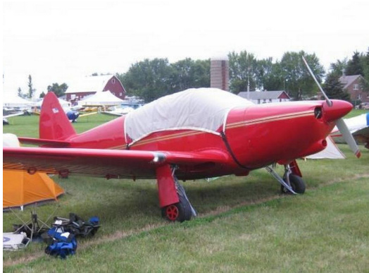
Globe Swift Canopy Cover

This cover type is made from Silver Acrylic Sunbrella canvas and is 100% lined with a soft and smooth microfiber. Bruce's Custom Covers developed this material combination especially for aircraft protection. The outer material is medium weight and treated for water resistance, UV resistance and anti-static buildup. The inner lining is a very soft and smooth microfiber to prevent scratching. The material is very reflective, and tests show that the cabin interior temperature can be reduced to near-ambient temperature on the hottest of days. It is water, ice and snow repellent, yet breathable to allow moisture to escape from between the cover and the aircraft surface.