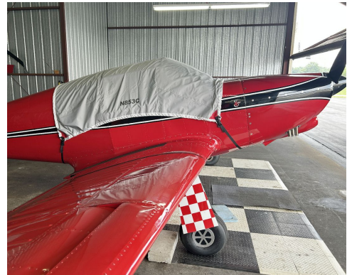
Swift Travel Cover, Light Weight Canopy Cover (Standard Canopy)