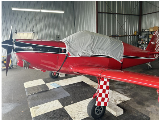
Swift Travel Cover, Light Weight Canopy Cover (Standard Canopy)

Travel Covers are made with Silver Solution-Dyed Polyester fabric and only lined over the windshield to save weight. The material is lightweight and more compact for easy stowage in the aircraft. The polyester material is water resistant, but only intended for occasional use outside. We also have an ultra lightweight material available for fitted hangar dust covers. For daily outdoor use, the non-travel Sunbrella Cover is the best choice.