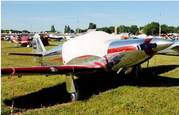
Standard Canopy Cover for Swift