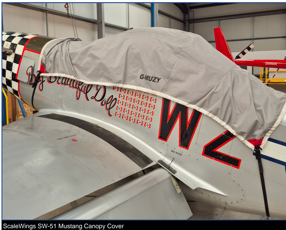
ScaleWings SW-51 Mustang Canopy Cover