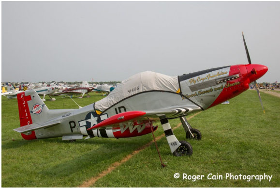
Titan Mustang Canopy Cover

the hottest of days. It is water, ice and snow repellent, yet breathable to allow moisture to escape from between the cover and the aircraft surface.