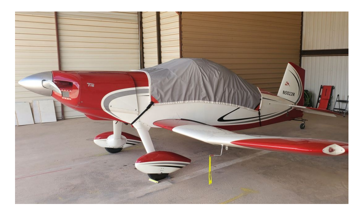
Thorp T-18 Travel Canopy Cover