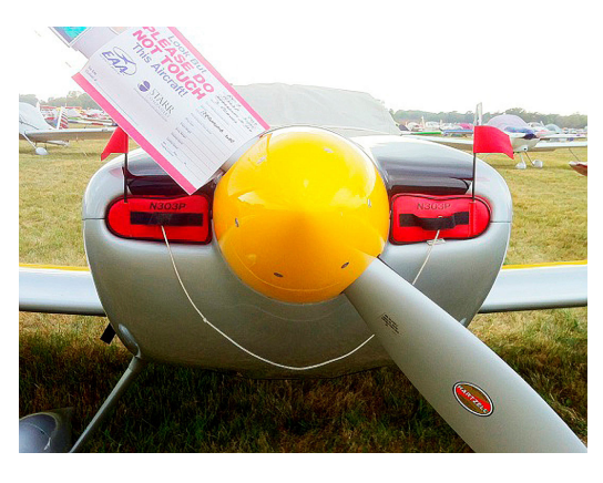
Vans's RV-7 Engine Engine Inlet Plugs