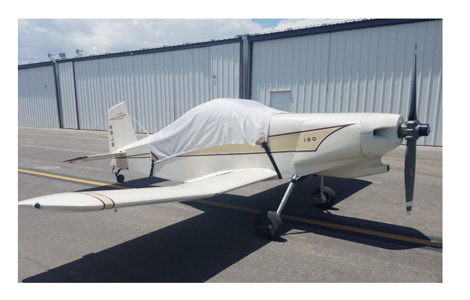
Thorp T-18 Bubble Canopy Cover