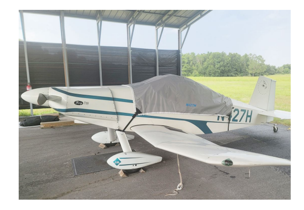
Thorp T-18 Travel Cover

Travel Covers are made with Silver Solution-Dyed Polyester fabric and only lined over the windshield to save weight. The material is lightweight and more compact for easy stowage in the aircraft. The polyester material is water resistant, but only intended for occasional use outside. We also have an ultra lightweight material available for fitted hangar dust covers. For daily outdoor use, the non-travel Sunbrella Cover is the best choice.