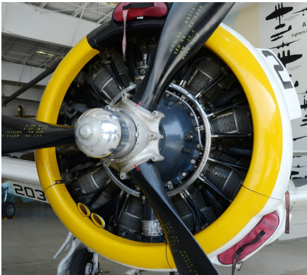
North American T28 Trojan Carb. Air Inlet Plug

Engine Inlet Plugs are custom fit for your North American T28 Trojan intakes, made with heavy-duty vinyl material, and stuffed with a single block of sculpted urethane foam. Each plug has a zipper that allows the foam to be removed and dried if necessary. Engine plugs have warning flags that are visible from the cockpit or 'remove before flight' streamers sewn onto the face of the plugs. Most plugs are imprinted with the aircraft registration number in black for an extra charge. Storage bag NOT included. Engine plugs may be inserted after flight when the engine is still warm. Engine Inlet Plugs are commonly referred to as Cowl Plugs, Intake Plugs, Cowl Blocks, Engine Blocks, and Engine Bungs.