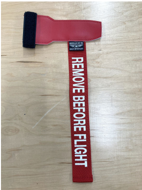
Pitot Tube Cover