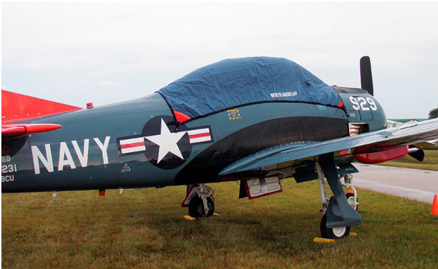
North American T28 Canopy Cover