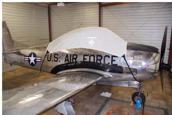
North American T-28 Canopy Cover