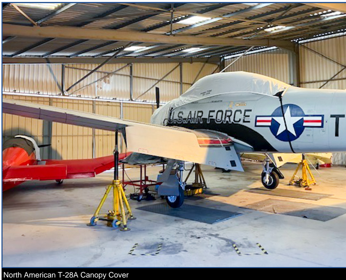
North American T-28A Canopy Cover