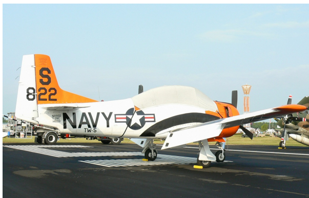
North American T-28 Canopy Cover

Travel Covers are made with Silver Solution-Dyed Polyester fabric and only lined over the windshield to save weight. The material is lightweight and more compact for easy stowage in the aircraft. The polyester material is water resistant, but only intended for occasional use outside. We also have an ultra lightweight material available for fitted hangar dust covers. For daily outdoor use, the non-travel Sunbrella Cover is the best choice.