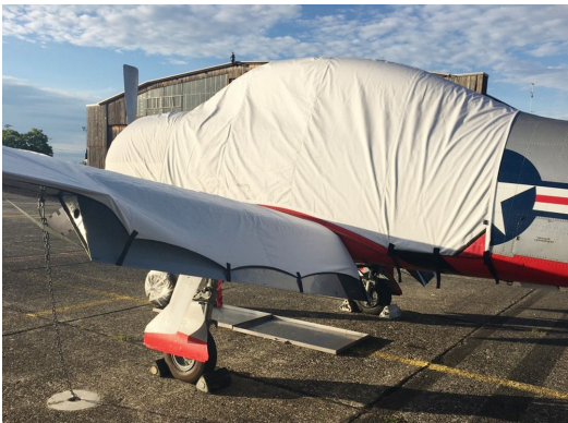
North American T28 Extended Canopy CoverT28 Horizontal Stabilizer Covers North American T28 Extended Canopy Cover