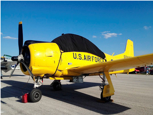
North American T28 Canopy Cover

This cover type is made from Silver Acrylic Sunbrella canvas and is 100% lined with a soft and smooth microfiber. Bruce's Custom Covers developed this material combination especially for aircraft protection. The outer material is medium weight and treated for water resistance, UV resistance and anti-static buildup. The inner lining is a very soft and smooth microfiber to prevent scratching. The material is very reflective, and tests show that the cabin interior temperature can be reduced to near-ambient temperature on the hottest of days. It is water, ice and snow repellent, yet breathable to allow moisture to escape from between the cover and the aircraft surface.