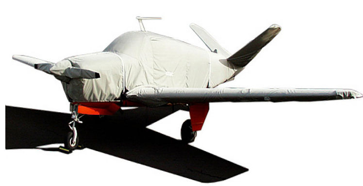
Beech Bonanza Full Cover Set

WINTER USE MATERIAL - Made with Solution-Dyed Polyester fabric, this option is intended for seasonal use to aid in deicing, rain mitigation, or for occasional travel. The material is lighter and more compact, but more susceptible to UV damage and may have a shorter useful life if used continuously outside than the all-year use material.