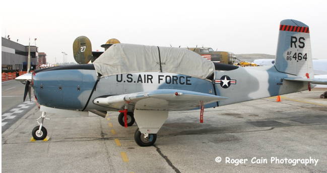
Beech T34 Canopy Cover