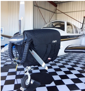
Beech Bonanza 36 Models Insulated Engine Cover