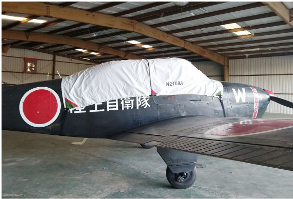
Fuji LM Canopy Cover

This cover type is made from Silver Acrylic Sunbrella canvas and is 100% lined with a soft and smooth microfiber. Bruce's Custom Covers developed this material combination especially for aircraft protection. The outer material is medium weight and treated for water resistance, UV resistance and anti-static buildup. The inner lining is a very soft and smooth microfiber to prevent scratching. The material is very reflective, and tests show that the cabin interior temperature can be reduced to near-ambient temperature on the hottest of days. It is water, ice and snow repellent, yet breathable to allow moisture to escape from between the cover and the aircraft surface.