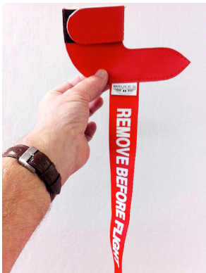
Standard Pitot Cover