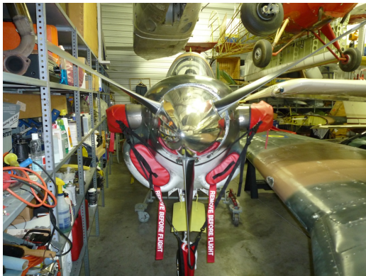
Beech T34C Engine Plugs, Prop Tie/Exhaust Plugs

This cover type is made from Silver Acrylic Sunbrella canvas and is 100% lined with a soft and smooth microfiber. Bruce's Custom Covers developed this material combination especially for aircraft protection. The outer material is medium weight and treated for water resistance, UV resistance and anti-static buildup. The inner lining is a very soft and smooth microfiber to prevent scratching. The material is very reflective, and tests show that the cabin interior temperature can be reduced to near-ambient temperature on the hottest of days. It is water, ice and snow repellent, yet breathable to allow moisture to escape from between the cover and the aircraft surface.