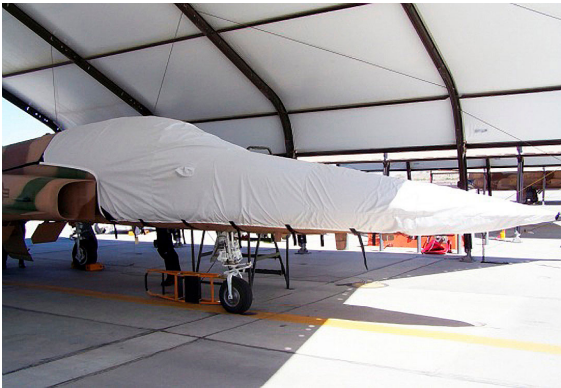
Northup F-5 Talon Canopy/Nose Cover

This cover type is made from Silver Acrylic Sunbrella canvas and is 100% lined with a soft and smooth microfiber. Bruce's Custom Covers developed this material combination especially for aircraft protection. The outer material is medium weight and treated for water resistance, UV resistance and anti-static buildup. The inner lining is a very soft and smooth microfiber to prevent scratching. The material is very reflective, and tests show that the cabin interior temperature can be reduced to near-ambient temperature on the hottest of days. It is water, ice and snow repellent, yet breathable to allow moisture to escape from between the cover and the aircraft surface.