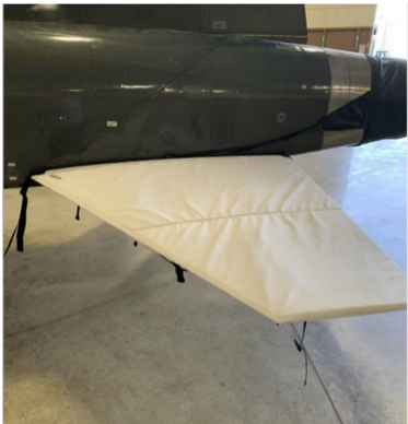
Northrup T-38 Horizontal Stabilizer Covers