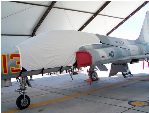
Northrop F5 Talon Canopy Cover

Travel Covers are made with Silver Solution-Dyed Polyester fabric and only lined over the windshield to save weight. The material is lightweight and more compact for easy stowage in the aircraft. The polyester material is water resistant, but only intended for occasional use outside. We also have an ultra lightweight material available for fitted hangar dust covers. For daily outdoor use, the non-travel Sunbrella Cover is the best choice.