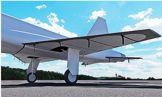
T-38 Talon Wing and Horizontal Stabilizer Covers (3D Rendering)

WINTER USE MATERIAL - Made with Solution-Dyed Polyester fabric, this option is intended for seasonal use to aid in deicing, rain mitigation, or for occasional travel. The material is lighter and more compact, but more susceptible to UV damage and may have a shorter useful life if used continuously outside than the all-year use material.