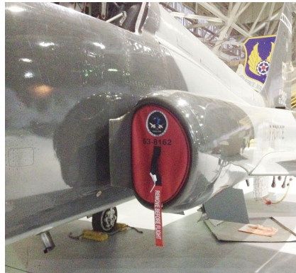
Northrup Grumman T38-C Intake Plugs

The Engine Inlet Plugs are custom fit for your Northrop Talon T-38 Trainer intakes, made with heavy-duty vinyl material, and stuffed with a single block of sculpted urethane foam. Each plug has a zipper that allows the foam to be removed and dried if necessary. Engine plugs have 'remove before flight' streamers sewn onto the face of the plugs. Most plugs are imprinted with the aircraft registration number in black for an extra charge. Storage bag NOT included. Engine plugs may be inserted after flight when the engine is still warm. Engine Inlet Plugs are commonly referred to as Cowl Plugs, Intake Plugs, Cowl Blocks, Engine Blocks, and Engine Bungs.