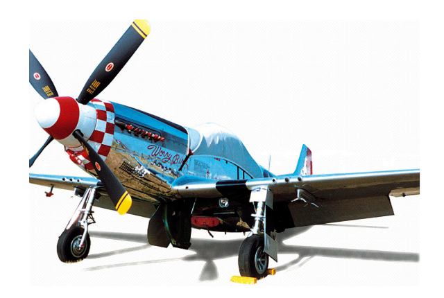
Canopy Cover, Belly & Chin Scoop Plugs