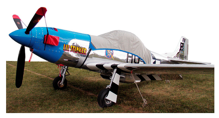
Stewart Mustang Canopy Cover, Prop Tie Downs & Intake Plugs Stewart Mustang Canopy Cover, Prop Tie Downs & Intake Plugs