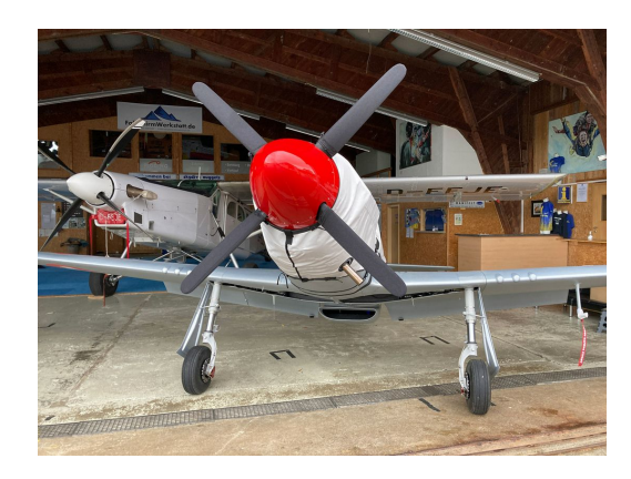
SW-51 Mustang Engine Cover

This cover type is made from Silver Acrylic Sunbrella canvas and is 100% lined with a soft and smooth microfiber. Bruce's Custom Covers developed this material combination especially for aircraft protection. The outer material is medium weight and treated for water resistance, UV resistance and anti-static buildup. The inner lining is a very soft and smooth microfiber to prevent scratching. The material is very reflective, and tests show that the cabin interior temperature can be reduced to near-ambient temperature on the hottest of days. It is water, ice and snow repellent, yet breathable to allow moisture to escape from between the cover and the aircraft surface.