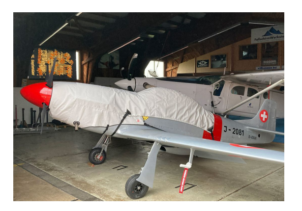
SW-51 Mustang Canopy & Engine Covers