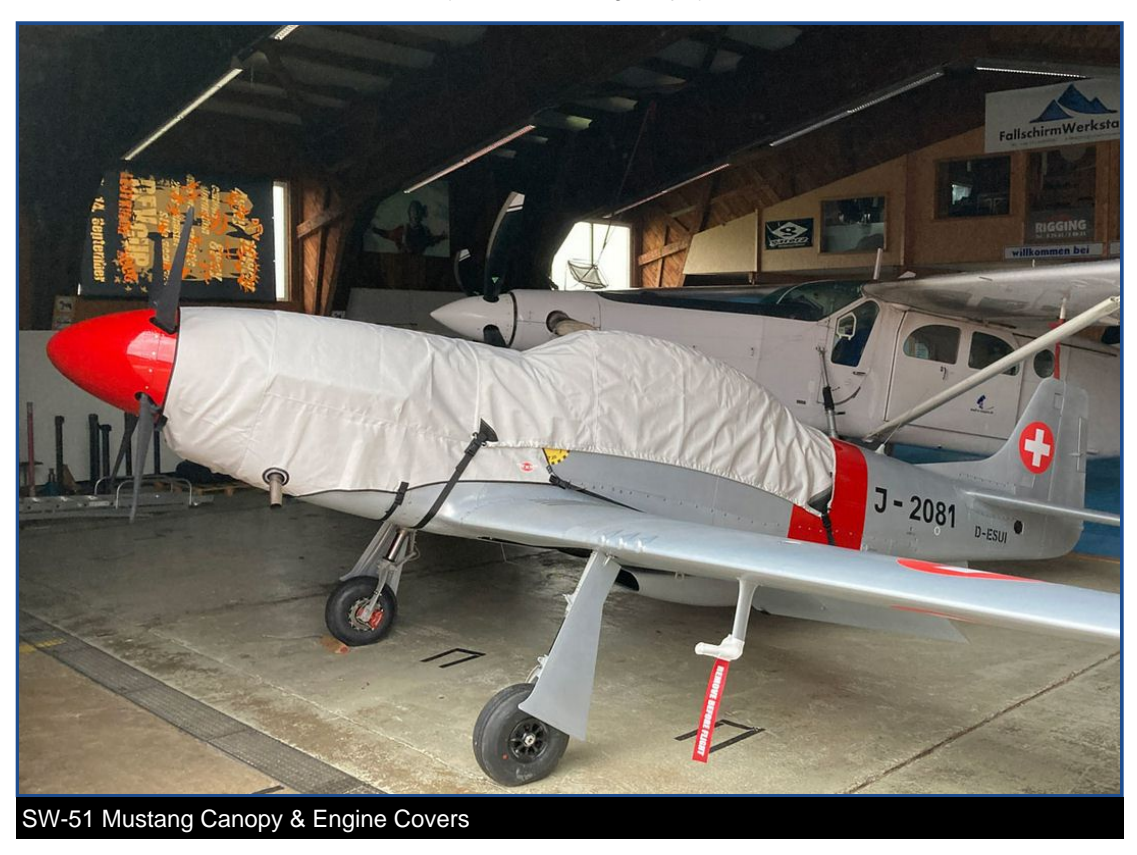
Section 1: Canopy/Cockpit/Fuselage Covers

Canopy Covers help reduce damage to your airplane's upholstery and avionics caused by excessive heat, and they can eliminate problems caused by leaking door and window seals. They keep the windshield and window surfaces clean and help prevent vandalism and theft.