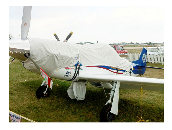
Thunder Mustang Canopy & Engine Cover

This cover type is made from Silver Acrylic Sunbrella canvas and is 100% lined with a soft and smooth microfiber. Bruce's Custom Covers developed this material combination especially for aircraft protection. The outer material is medium weight and treated for water resistance, UV resistance and anti-static buildup. The inner lining is a very soft and smooth microfiber to prevent scratching. The material is very reflective, and tests show that the cabin interior temperature can be reduced to near-ambient temperature on the hottest of days. It is water, ice and snow repellent, yet breathable to allow moisture to escape from between the cover and the aircraft surface.