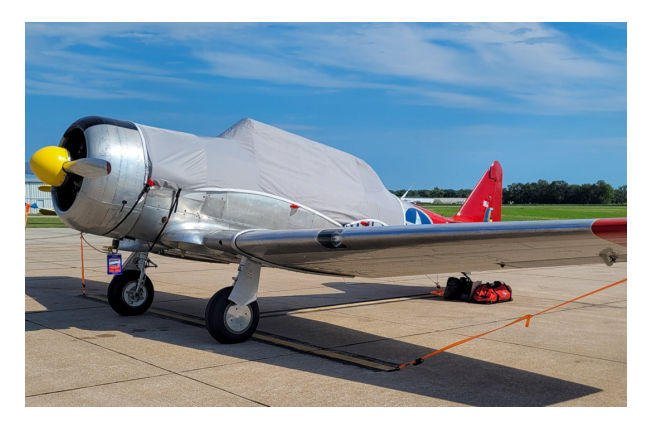
North American T6 Travel Cover, Light Weight Canopy Cover with 50" fwd ext