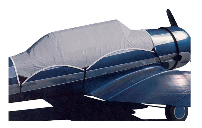
Canopy Cover with Forward Extension