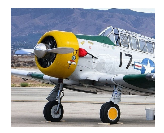
North American T6 Carb Air Scoop Cover