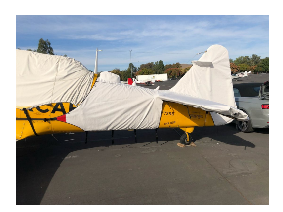
North American T6 Empennage Cover