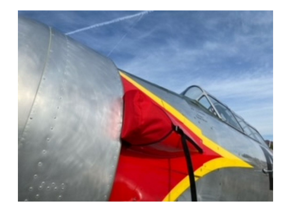
North American T6 Carb Air Scoop Cover