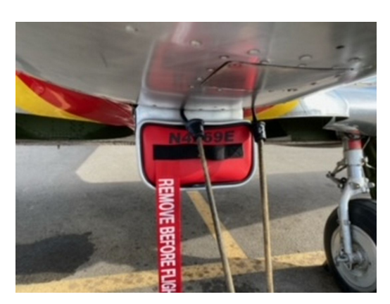
North American T6 Chin Scoop Plug