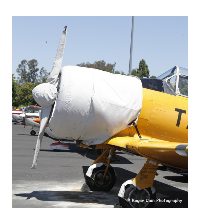
North American T6 Engine & Prop Cover