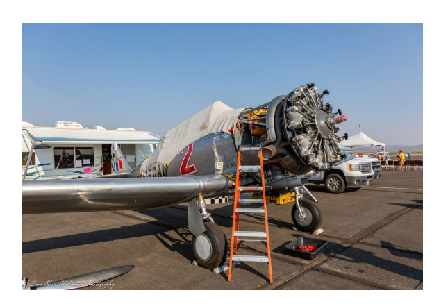
North American T6 Canopy Cover

This cover type is made from Silver Acrylic Sunbrella canvas and is 100% lined with a soft and smooth microfiber. Bruce's Custom Covers developed this material combination especially for aircraft protection. The outer material is medium weight and treated for water resistance, UV resistance and anti-static buildup. The inner lining is a very soft and smooth microfiber to prevent scratching. The material is very reflective, and tests show that the cabin interior temperature can be reduced to near-ambient temperature on the hottest of days. It is water, ice and snow repellent, yet breathable to allow moisture to escape from between the cover and the aircraft surface.