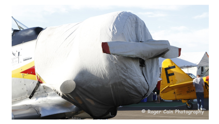
North American T6 Engine & Prop Cover

This cover type is made from Silver Acrylic Sunbrella canvas and is 100% lined with a soft and smooth microfiber. Bruce's Custom Covers developed this material combination especially for aircraft protection. The outer material is medium weight and treated for water resistance, UV resistance and anti-static buildup. The inner lining is a very soft and smooth microfiber to prevent scratching. The material is very reflective, and tests show that the cabin interior temperature can be reduced to near-ambient temperature on the hottest of days. It is water, ice and snow repellent, yet breathable to allow moisture to escape from between the cover and the aircraft surface.