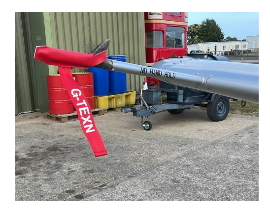
T6 Harvard Pitot Cover, shark fin type

Engine Inlet Plugs are custom fit for your North American T6, SNJ, Harvard intakes, made with heavy-duty vinyl material, and stuffed with a single block of sculpted urethane foam. Each plug has a zipper that allows the foam to be removed and dried if necessary. Engine plugs have warning flags that are visible from the cockpit or 'remove before flight' streamers sewn onto the face of the plugs. Most plugs are imprinted with the aircraft registration number in black for an extra charge. Storage bag NOT included. Engine plugs may be inserted after flight when the engine is still warm. Engine Inlet Plugs are commonly referred to as Cowl Plugs, Intake Plugs, Cowl Blocks, Engine Blocks, and Engine Bungs.