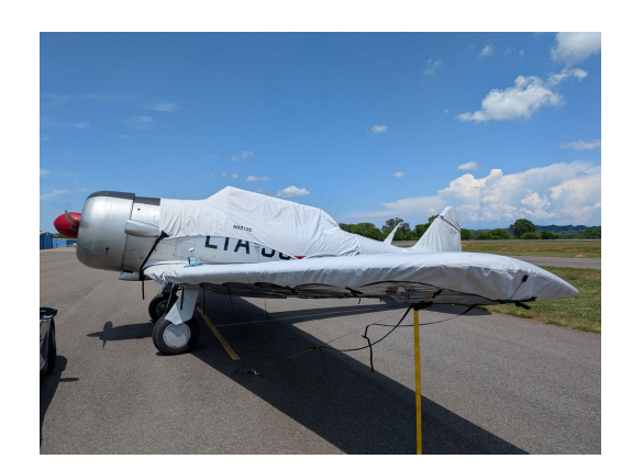
North American T6 Canopy Cover w/30" Extension, Wing Covers

WINTER USE MATERIAL - Made with Solution-Dyed Polyester fabric, this option is intended for seasonal use to aid in deicing, rain mitigation, or for occasional travel. The material is lighter and more compact, but more susceptible to UV damage and may have a shorter useful life if used continuously outside than the all-year use material.