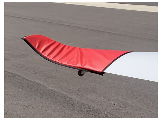
Pipistrel Taurus & Electro Wingtip Pads