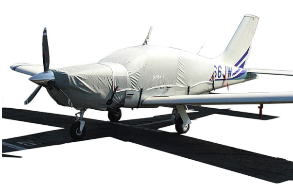
Canopy Cover & Engine Cover

This cover type is made from Silver Acrylic Sunbrella canvas and is 100% lined with a soft and smooth microfiber. Bruce's Custom Covers developed this material combination especially for aircraft protection. The outer material is medium weight and treated for water resistance, UV resistance and anti-static buildup. The inner lining is a very soft and smooth microfiber to prevent scratching. The material is very reflective, and tests show that the cabin interior temperature can be reduced to near-ambient temperature on the hottest of days. It is water, ice and snow repellent, yet breathable to allow moisture to escape from between the cover and the aircraft surface.