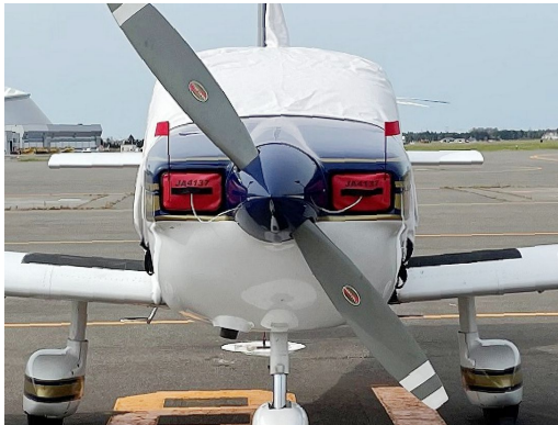
Socata TB10 Engine Plugs