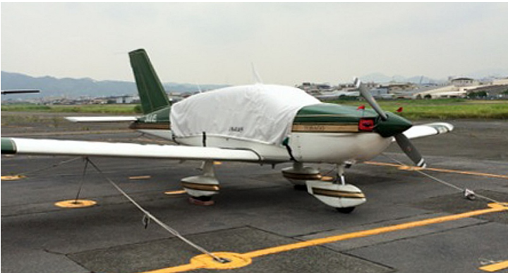
Socata TB-20 Canopy Cover

This cover type is made from Silver Acrylic Sunbrella canvas and is 100% lined with a soft and smooth microfiber. Bruce's Custom Covers developed this material combination especially for aircraft protection. The outer material is medium weight and treated for water resistance, UV resistance and anti-static buildup. The inner lining is a very soft and smooth microfiber to prevent scratching. The material is very reflective, and tests show that the cabin interior temperature can be reduced to near-ambient temperature on the hottest of days. It is water, ice and snow repellent, yet breathable to allow moisture to escape from between the cover and the aircraft surface.