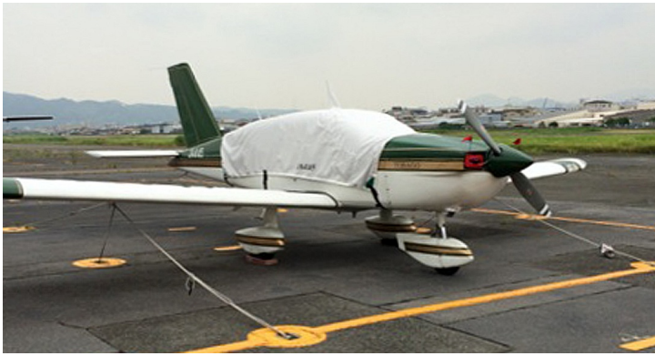
Socata TB-20 Canopy Cover