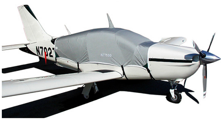
TB20 Standard Canopy Cover