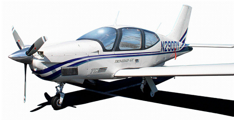
Socata TB20 HeatShields