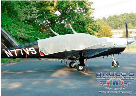
Socata TB20 Canopy Cover

This cover type is made from Silver Acrylic Sunbrella canvas and is 100% lined with a soft and smooth microfiber. Bruce's Custom Covers developed this material combination especially for aircraft protection. The outer material is medium weight and treated for water resistance, UV resistance and anti-static buildup. The inner lining is a very soft and smooth microfiber to prevent scratching. The material is very reflective, and tests show that the cabin interior temperature can be reduced to near-ambient temperature on the hottest of days. It is water, ice and snow repellent, yet breathable to allow moisture to escape from between the cover and the aircraft surface.