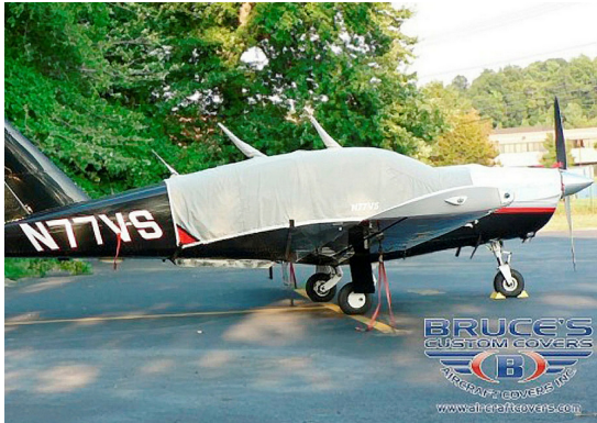
Socata TB20 Canopy Cover

Travel Covers are made with Silver Solution-Dyed Polyester fabric and only lined over the windshield to save weight. The material is lightweight and more compact for easy stowage in the aircraft. The polyester material is water resistant, but only intended for occasional use outside. We also have an ultra lightweight material available for fitted hangar dust covers. For daily outdoor use, the non-travel Sunbrella Cover is the best choice.