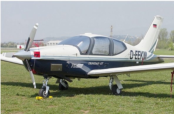
TB-9 Engine Plugs and HeatShields