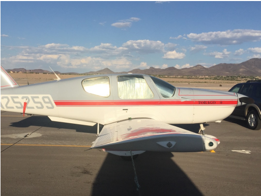
Socata TB-10 Cabin HeatShields

Windshield Heatshields are interior sunshades for an aircraft's front windshield. The product is a unique composite of closed-cell foam with a silver mylar finish. The semi-rigid design is stiff enough to stand along the inside of the windshield using sun visors or window framing. It folds up flat and easily stores in the included storage sleeve. Some designs may require velcro and suction cups or split right and left sides. A Heatshield is an excellent short-term remedy for cockpit overheating. An external fabric cover is far more effective and practical for long-term protection.