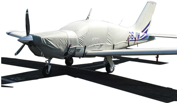
Canopy Cover & Engine Cover