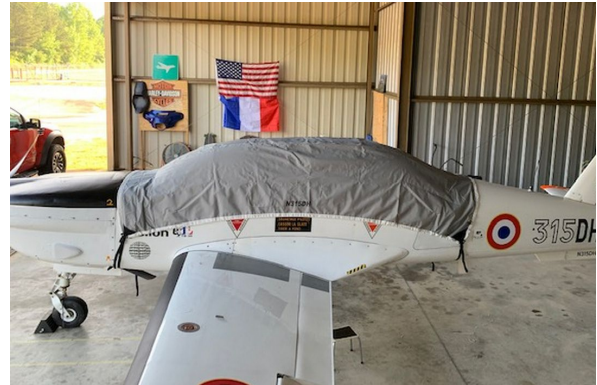
Socata TB-30 Travel Weight Canopy Cover