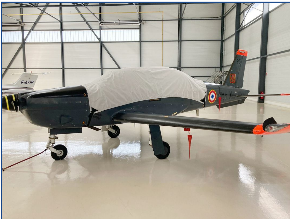
Socata TB-30 Epsilon Canopy Cover