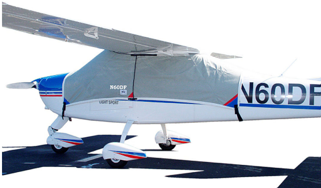
Tecnam Bravo Canopy Cover