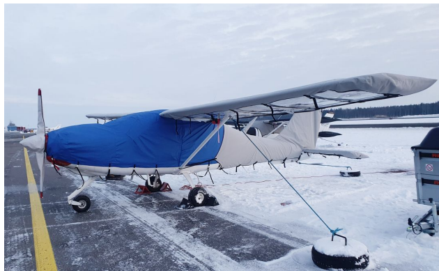
Tecnam P2010 Wing, Empennage & Prop Covers

This cover type is made from Silver Acrylic Sunbrella canvas and is 100% lined with a soft and smooth microfiber. Bruce's Custom Covers developed this material combination especially for aircraft protection. The outer material is medium weight and treated for water resistance, UV resistance and anti-static buildup. The inner lining is a very soft and smooth microfiber to prevent scratching. The material is very reflective, and tests show that the cabin interior temperature can be reduced to near-ambient temperature on the hottest of days. It is water, ice and snow repellent, yet breathable to allow moisture to escape from between the cover and the aircraft surface.