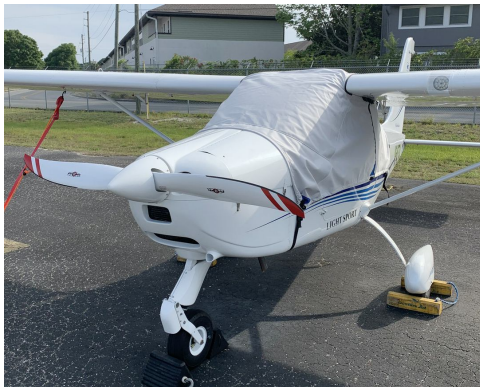
Tecnam P92 EAGLET Canopy Cover Over theTop Style

Travel Covers are made with Silver Solution-Dyed Polyester fabric and only lined over the windshield to save weight. The material is lightweight and more compact for easy stowage in the aircraft. The polyester material is water resistant, but only intended for occasional use outside. We also have an ultra lightweight material available for fitted hangar dust covers. For daily outdoor use, the non-travel Sunbrella Cover is the best choice.