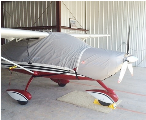
Tecnam P2008 Canopy Cover & Light Weight Engine Cover

This cover type is made from Silver Acrylic Sunbrella canvas and is 100% lined with a soft and smooth microfiber. Bruce's Custom Covers developed this material combination especially for aircraft protection. The outer material is medium weight and treated for water resistance, UV resistance and anti-static buildup. The inner lining is a very soft and smooth microfiber to prevent scratching. The material is very reflective, and tests show that the cabin interior temperature can be reduced to near-ambient temperature on the hottest of days. It is water, ice and snow repellent, yet breathable to allow moisture to escape from between the cover and the aircraft surface.