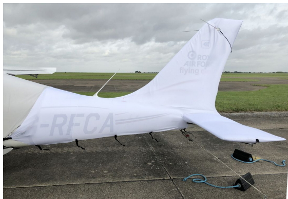
Tecnam P2008 Empennage Cover, test fit cover

WINTER USE MATERIAL - Made with Solution-Dyed Polyester fabric, this option is intended for seasonal use to aid in deicing, rain mitigation, or for occasional travel. The material is lighter and more compact, but more susceptible to UV damage and may have a shorter useful life if used continuously outside than the all-year use material.