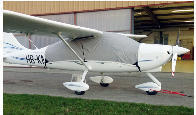
Tecnam P2008 Travel Cover