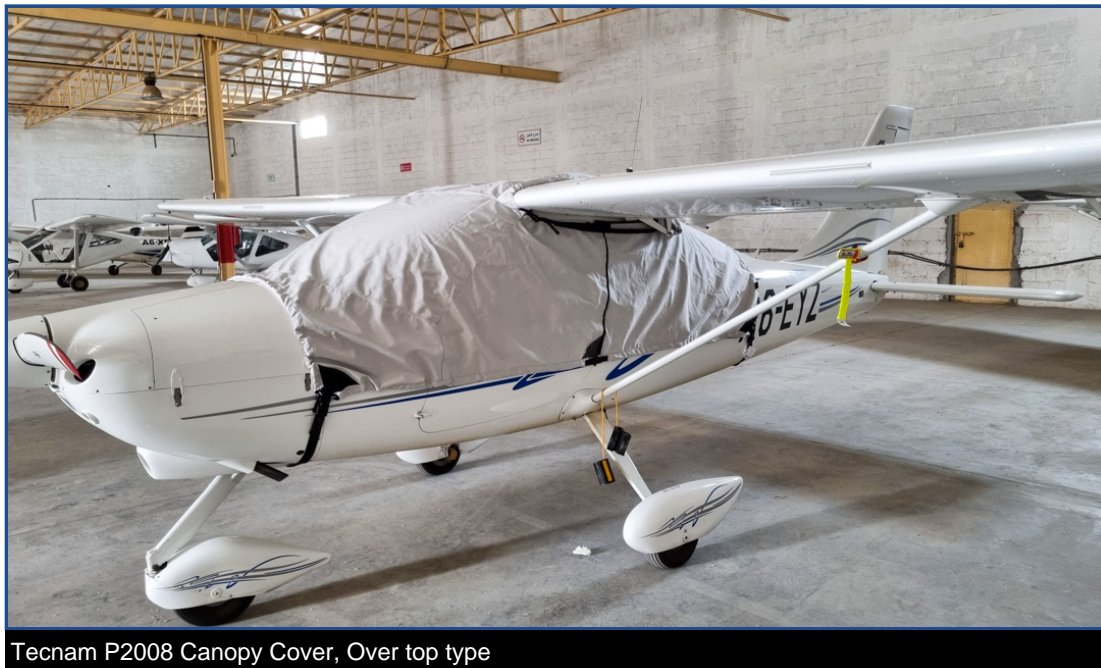
Tecnam P2008 Canopy Cover, Over top type