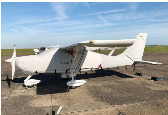
Tecnam P2008 Empennage Cover (Tailboom, Vertical & Horiz Stabilizers), All Year Use