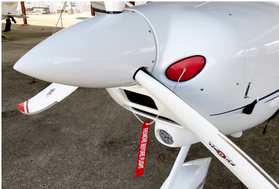
Tecnam P2008 Engine Inlet Plugs