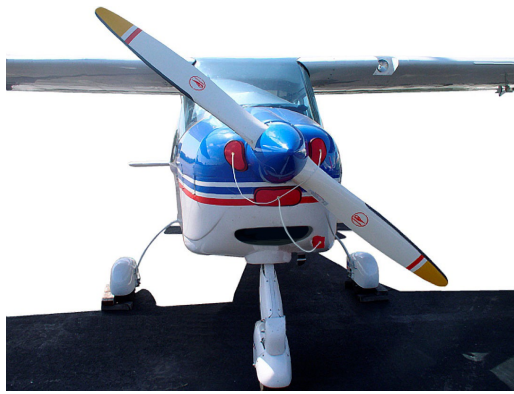
Tecnam Bravo Engine Plugs