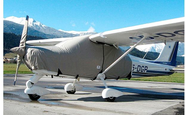
Tecnam Echo Extended Canopy, Engine, Prop Covers