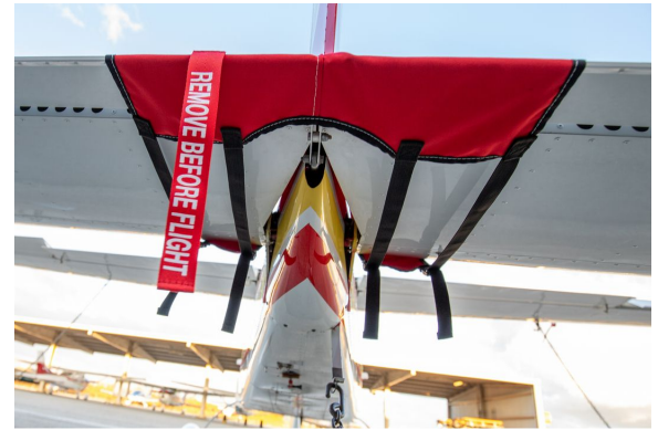
Tecnam Bravo Tailcone Cover