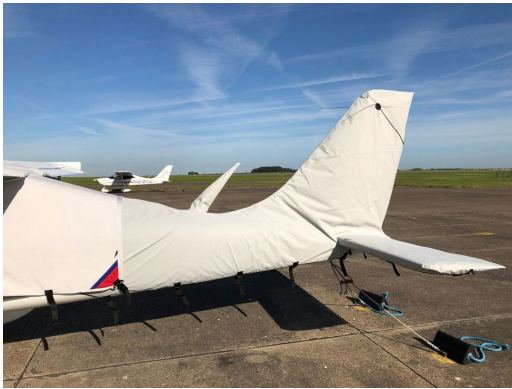
Tecnam P2008 Empennage Cover (Tailboom, Vertical & Horiz Stabilizers), All Year Use

WINTER USE MATERIAL - Made with Solution-Dyed Polyester fabric, this option is intended for seasonal use to aid in deicing, rain mitigation, or for occasional travel. The material is lighter and more compact, but more susceptible to UV damage and may have a shorter useful life if used continuously outside than the all-year use material.