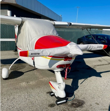
Tecnam Bravo Canopy & Prop Covers, Engine Plugs

This cover type is made from Silver Acrylic Sunbrella canvas and is 100% lined with a soft and smooth microfiber. Bruce's Custom Covers developed this material combination especially for aircraft protection. The outer material is medium weight and treated for water resistance, UV resistance and anti-static buildup. The inner lining is a very soft and smooth microfiber to prevent scratching. The material is very reflective, and tests show that the cabin interior temperature can be reduced to near-ambient temperature on the hottest of days. It is water, ice and snow repellent, yet breathable to allow moisture to escape from between the cover and the aircraft surface.