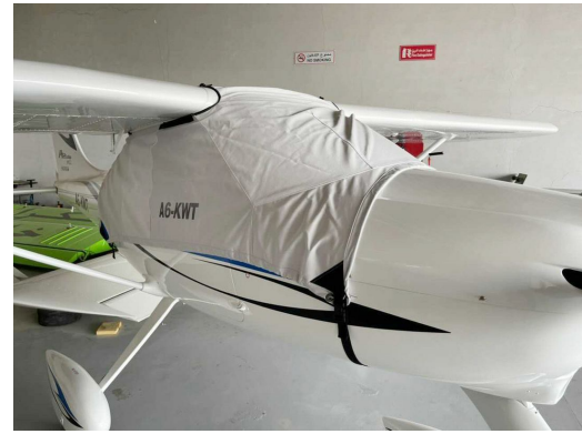
Tecnam P92 Echo Super Canopy Cover, Wrap-Around