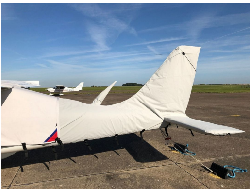
Tecnam P2010 Wing, Empennage & Prop Covers Tecnam P2008 Empennage Cover (Tailboom, Vertical & Horiz Stabilizers), All Year Use