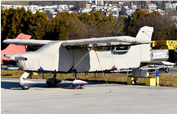
Tecnam P92 Echo Complete Cover Set