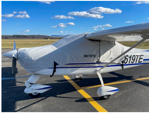
P92 Echo Super Canopy/Engine Cover, over top type