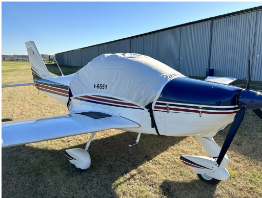
Tecnam P2002 Sierra Canopy Cover

This cover type is made from Silver Acrylic Sunbrella canvas and is 100% lined with a soft and smooth microfiber. Bruce's Custom Covers developed this material combination especially for aircraft protection. The outer material is medium weight and treated for water resistance, UV resistance and anti-static buildup. The inner lining is a very soft and smooth microfiber to prevent scratching. The material is very reflective, and tests show that the cabin interior temperature can be reduced to near-ambient temperature on the hottest of days. It is water, ice and snow repellent, yet breathable to allow moisture to escape from between the cover and the aircraft surface.