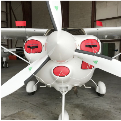
Tecnam P2010 Engine Plugs

Engine Inlet Plugs are custom fit for your Tecnam P2002 Sierra, P96 Golf, P-Mentor intakes, made with heavy-duty vinyl material, and stuffed with a single block of sculpted urethane foam. Each plug has a zipper that allows the foam to be removed and dried if necessary. Engine plugs have warning flags that are visible from the cockpit or 'remove before flight' streamers sewn onto the face of the plugs. Most plugs are imprinted with the aircraft registration number in black for an extra charge. Storage bag NOT included. Engine plugs may be inserted after flight when the engine is still warm. Engine Inlet Plugs are commonly referred to as Cowl Plugs, Intake Plugs, Cowl Blocks, Engine Blocks, and Engine Bungs.