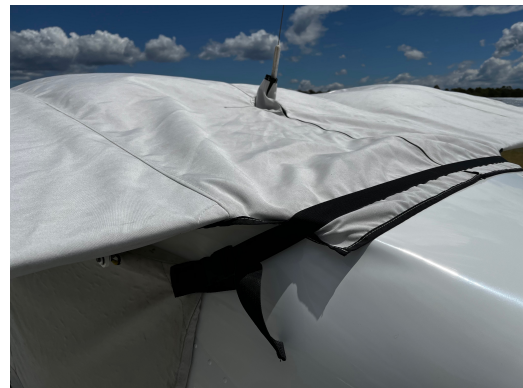
Tecnam P2006T Twin Wing & Engine Covers, All Year Use