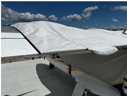
Tecnam P2006T Twin Wing & Engine Covers, All Year Use

WINTER USE MATERIAL - Made with Solution-Dyed Polyester fabric, this option is intended for seasonal use to aid in deicing, rain mitigation, or for occasional travel. The material is lighter and more compact, but more susceptible to UV damage and may have a shorter useful life if used continuously outside than the all-year use material.