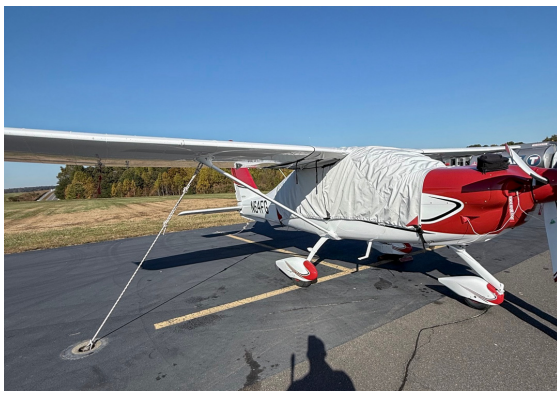
Costruzioni Aeronautiche Tecna P2010 TDI Canopy Cover, over-top-type