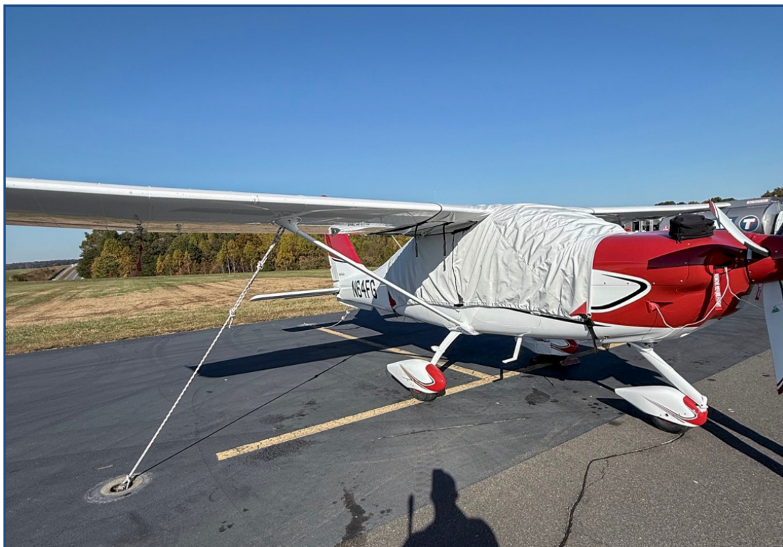
Costruzioni Aeronautiche Tecna P2010 TDI Canopy Cover, over-top-type