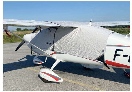
Tecnam P2010 Over-Top Canopy Cover