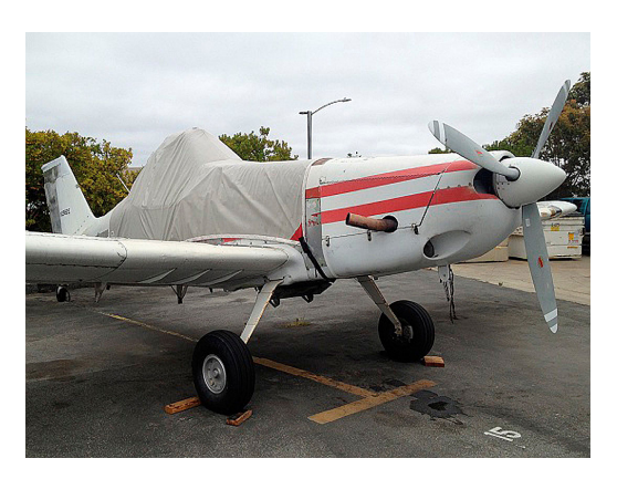
Thrush Aircraft S2R-T34 Canopy Cover, & Prop Tie/Exhaust Covers