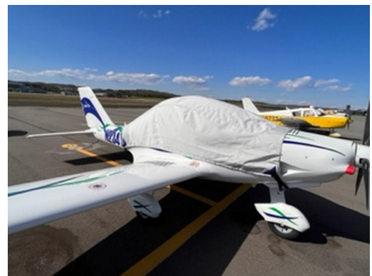
TL 2000 Sting Travel Weight Canopy Cover