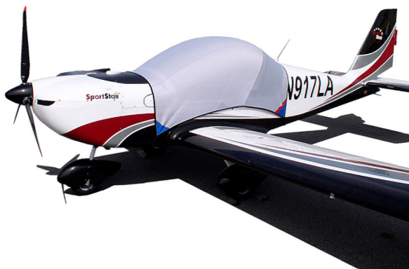
Evezkor Sportstar Light Weight Travel-Cover

This cover type is made from Silver Acrylic Sunbrella canvas and is 100% lined with a soft and smooth microfiber. Bruce's Custom Covers developed this material combination especially for aircraft protection. The outer material is medium weight and treated for water resistance, UV resistance and anti-static buildup. The inner lining is a very soft and smooth microfiber to prevent scratching. The material is very reflective, and tests show that the cabin interior temperature can be reduced to near-ambient temperature on the hottest of days. It is water, ice and snow repellent, yet breathable to allow moisture to escape from between the cover and the aircraft surface.