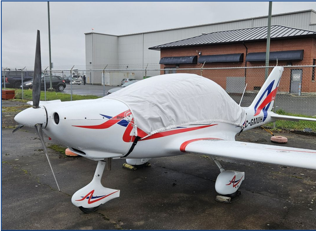
TL 2000 Sting Sport Canopy Cover