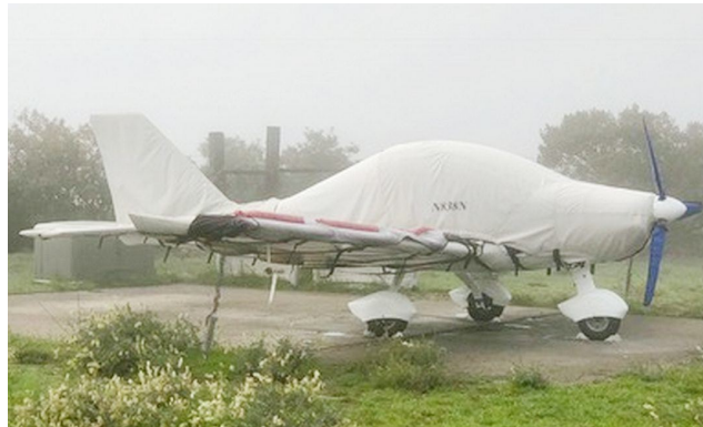
TL Sting Sport Full Cover Set

WINTER USE MATERIAL - Made with Solution-Dyed Polyester fabric, this option is intended for seasonal use to aid in deicing, rain mitigation, or for occasional travel. The material is lighter and more compact, but more susceptible to UV damage and may have a shorter useful life if used continuously outside than the all-year use material.