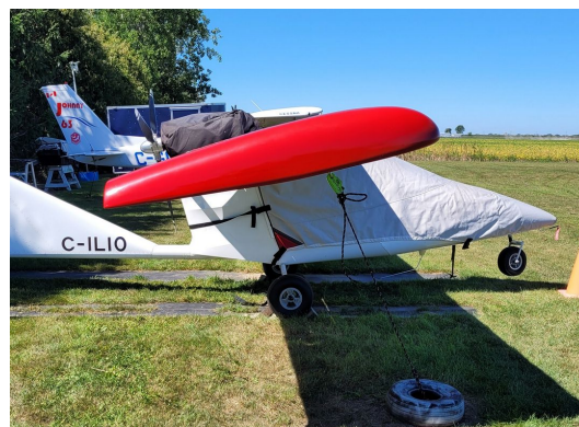
Titan Tornado Canopy/Nose Cover