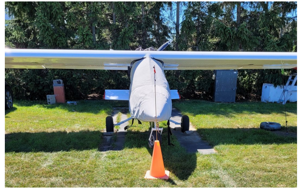
Titan Tornado Canopy/Nose Cover