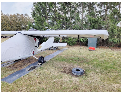
Titan Tornado Canopy/Nose, Wings & Empennage Cover