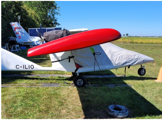
Titan Tornado Canopy/Nose Cover