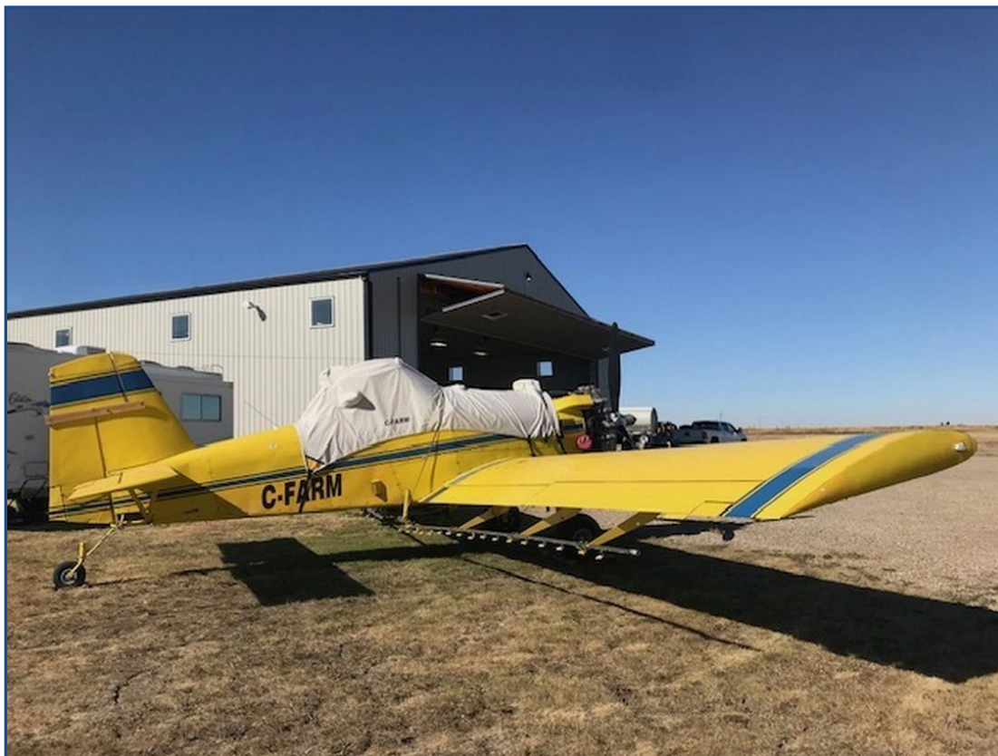
Air Tractor 401 Canopy/Hopper Cover