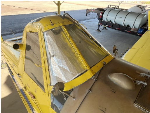
Air Tractor Cockpit HeatShields

foam with a silver mylar finish. The semi-rigid design is stiff enough to stand along the inside of the windshield using sun visors or window framing. It folds up flat and easily stores in the included storage sleeve. Some designs may require velcro and suction cups or split right and left sides. A Heatshield is an excellent short-term remedy for cockpit overheating. An external fabric cover is far more effective and practical for long-term protection.