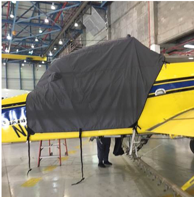
Air Tractor AT-802F Canopy Cover