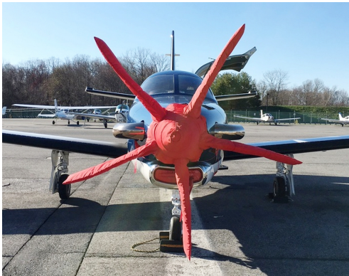
Socata TBM Insulated 5-Blade Prop/Spinner Cover

This cover type is made from Silver Acrylic Sunbrella canvas and is 100% lined with a soft and smooth microfiber. Bruce's Custom Covers developed this material combination especially for aircraft protection. The outer material is medium weight and treated for water resistance, UV resistance and anti-static buildup. The inner lining is a very soft and smooth microfiber to prevent scratching. The material is very reflective, and tests show that the cabin interior temperature can be reduced to near-ambient temperature on the hottest of days. It is water, ice and snow repellent, yet breathable to allow moisture to escape from between the cover and the aircraft surface.