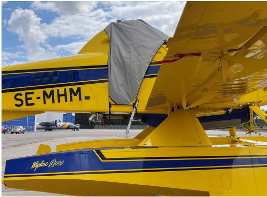
Air Tractor Light Weight Canopy Cover

This cover type is made from Silver Acrylic Sunbrella canvas and is 100% lined with a soft and smooth microfiber. Bruce's Custom Covers developed this material combination especially for aircraft protection. The outer material is medium weight and treated for water resistance, UV resistance and anti-static buildup. The inner lining is a very soft and smooth microfiber to prevent scratching. The material is very reflective, and tests show that the cabin interior temperature can be reduced to near-ambient temperature on the hottest of days. It is water, ice and snow repellent, yet breathable to allow moisture to escape from between the cover and the aircraft surface.