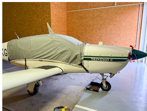
Trinidad TB20 Travel Cover, Light Weight Canopy Cover