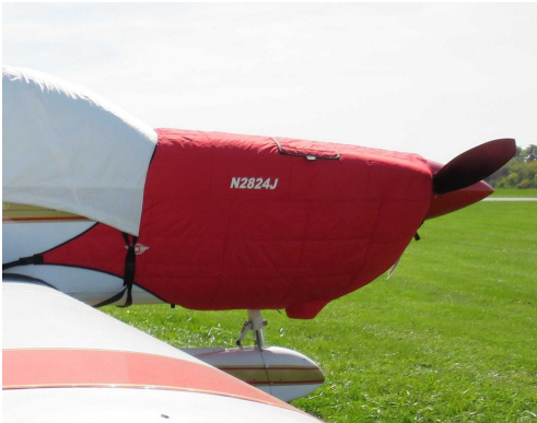
Socata TB-10 Insulated Engine Cover