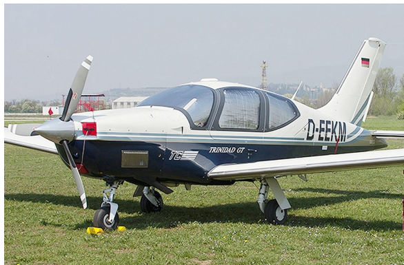
TB-9 Engine Plugs and HeatShields