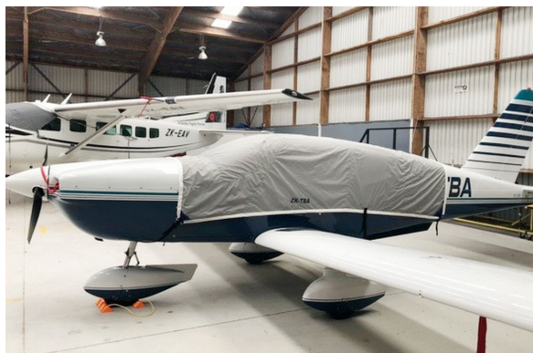
Socata TB-9 TRAVEL COVER, Light Weight Canopy Cover

Travel Covers are made with Silver Solution-Dyed Polyester fabric and only lined over the windshield to save weight. The material is lightweight and more compact for easy stowage in the aircraft. The polyester material is water resistant, but only intended for occasional use outside. We also have an ultra lightweight material available for fitted hangar dust covers. For daily outdoor use, the non-travel Sunbrella Cover is the best choice.