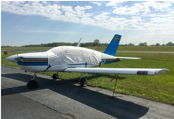
Socata TB-9 Canopy Cover

This cover type is made from Silver Acrylic Sunbrella canvas and is 100% lined with a soft and smooth microfiber. Bruce's Custom Covers developed this material combination especially for aircraft protection. The outer material is medium weight and treated for water resistance, UV resistance and anti-static buildup. The inner lining is a very soft and smooth microfiber to prevent scratching. The material is very reflective, and tests show that the cabin interior temperature can be reduced to near-ambient temperature on the hottest of days. It is water, ice and snow repellent, yet breathable to allow moisture to escape from between the cover and the aircraft surface.