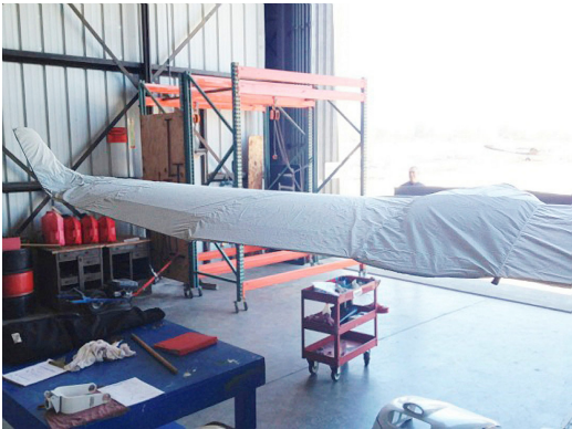
Tecnam Twin Wing/Engine Covers