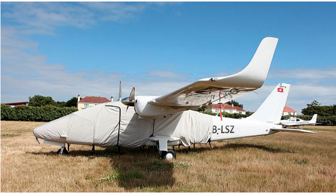
Tecnam Twin Extended Canopy/Nose Cover