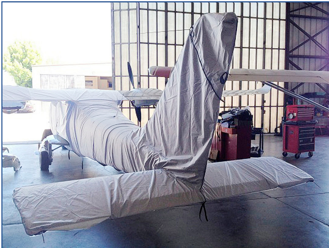
Tecnam Twin Canopy/Nose, Empennage, Wing/Engine, &amp; Propellor/Spinner Covers