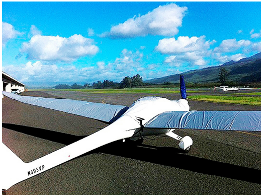
Lambda Canopy/Engine Cover and Wing Covers

WINTER USE MATERIAL - Made with Solution-Dyed Polyester fabric, this option is intended for seasonal use to aid in deicing, rain mitigation, or for occasional travel. The material is lighter and more compact, but more susceptible to UV damage and may have a shorter useful life if used continuously outside than the all-year use material.