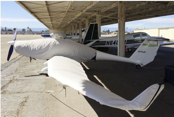
Phoenix Air U-15 Canopy/Engine, Wing & Horizontal Stabilizer Covers