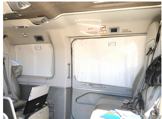
Eurocopter EC-145 Cabin Heatshields