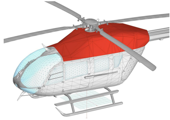
Intake/Exhaust Engine Area Cover, 3D Rendering