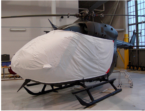
EC-145 Bubble Cover

Covers developed this material combination especially for aircraft protection. The outer material is medium weight and treated for water resistance, UV resistance and anti-static buildup. The inner lining is a very soft and smooth microfiber to prevent scratching. The material is very reflective, and tests show that the cabin interior temperature can be reduced to near-ambient temperature on the hottest of days. It is water, ice and snow repellent, yet breathable to allow moisture to escape from between the cover and the aircraft surface.